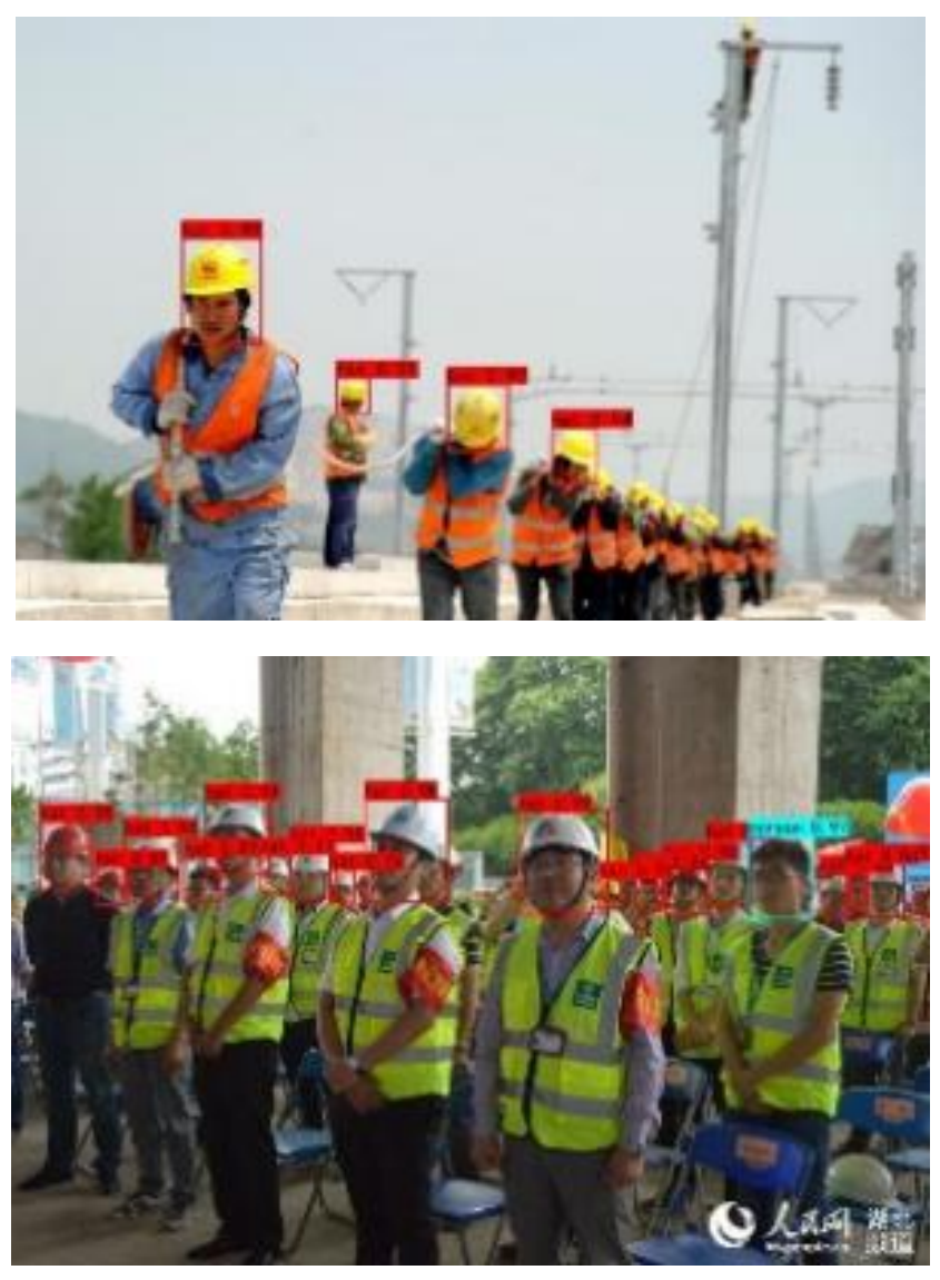
Figure 3. YOLOv4 mobileNetv3 detection result.