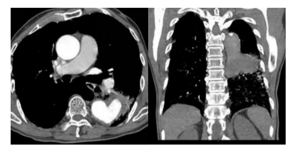
Figure 1. Chest computed tomographyan giography (Before surgery).

Physical examination: T: 36.8°C. P: 87 beats/minute R: 17 beats/minute BP: 123/70 mmHg, the percussion sounds of both lungs are over-voiced, and the breath sounds of both lungs are clear and wet rales can be heard. There was no enlargement of the heart circle, HR: 87 bpm, the rhythm was neat, no pathological murmur was heard in the auscultation area of each valve, and there was no edema in the limbs. He had a history of hyperuricemia and emphysema for more than 20 years, and a history of trauma to the right eye for more than 10 years. He denied other medical history. Considering that the patient's aneurysm is large and it is difficult to control respiratory activity with other underlying diseases, in order to avoid false aneurysm rupture, intravascular interventional therapy was performed after consultation with family members. Aortic arch angiography showed that the descending aorta showed a breach at about T7 level, false Aneurysm formation. A 34 mm × 200 mm aortic stent was then placed, and the breach disappeared after another angiography, no contrast agent continued to overflow, blood flow in the left subclavian artery was smooth (Figure 2, Figure 3), the patient's postoperative hemoptysis disappeared and he was discharged 7 days later. Follow-up for 3 weeks, the hemoptysis no longer appear and no other discomfort except for mild chest tightness. An informed consent was obtained from the patient to report the case.