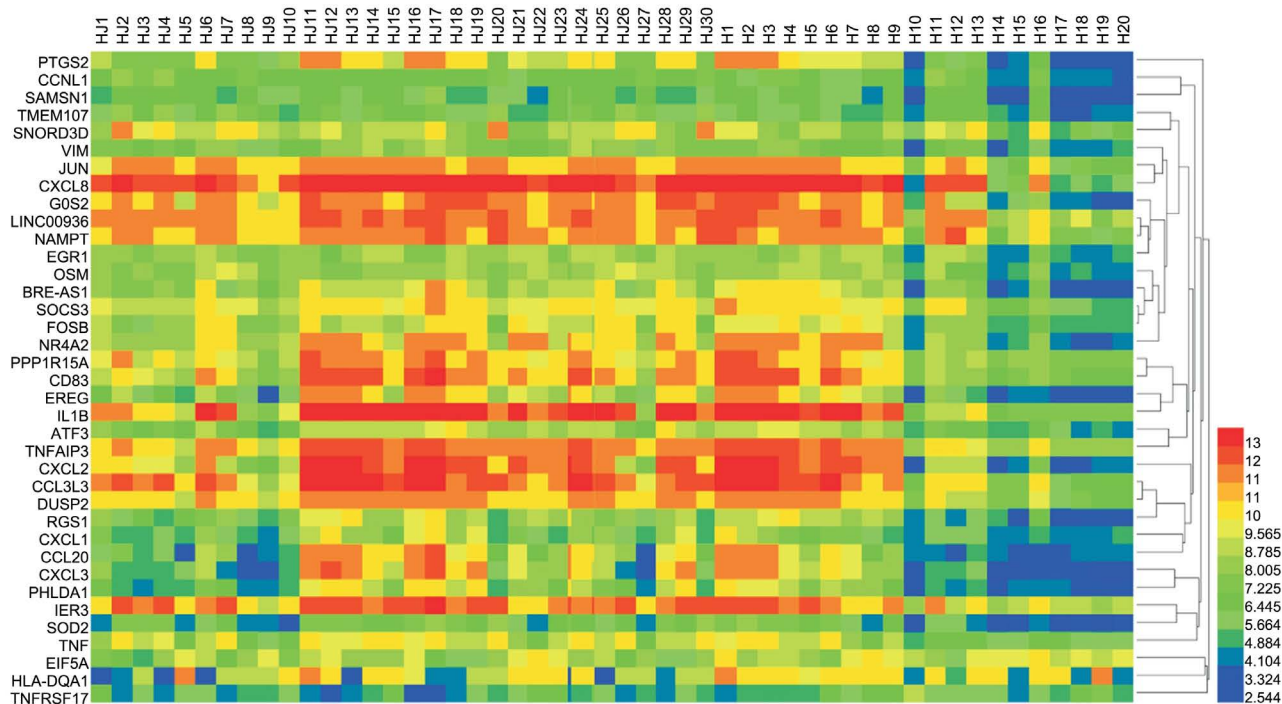
Figure 1. Heat map of differentially expressed PBMCs between HJ patients and control group. Note: HJ: Type H hypertension with acute cerebral infarction, PBMCs: peripheral blood mononuclear cells; The differential gene expression was represented from high to low in red to blue, the left side of the heat map was the gene name, the top was the sample number (HJ was the group of H-type hypertension with acute cerebral infarction, H was the control group), and the tree structure on the right side represented the similarity clustering relationship between the samples.

GO analysis of the screened differentially expressed genes showed that, in terms of biological processes, the differentially expressed genes were divided into 51 categories, including 9 categories containing more than 5 genes, mainly focusing on inflammatory response and immune response, chemotaxis, cell proliferation and apoptosis, etc. In terms of cell composition, the differentially expressed genes were mainly distributed in cytoplasm and extracellular space. In terms of molecular function, differentially expressed genes can be divided into 6 categories, mainly focusing on chemokine activity and receptor binding, transcription factor activity, and cytokine activity, with chemokine activity-related genes being the most. In this study, GO functional analysis showed that most of the functions were expressed by multiple gene variants, which indirectly confirmed that H-type hypertension with acute cerebral infarction is a complex disease caused by the action of multiple genes. KEGG signaling pathway analysis showed that the differentially expressed genes were mainly distributed in tumor necrosis factor