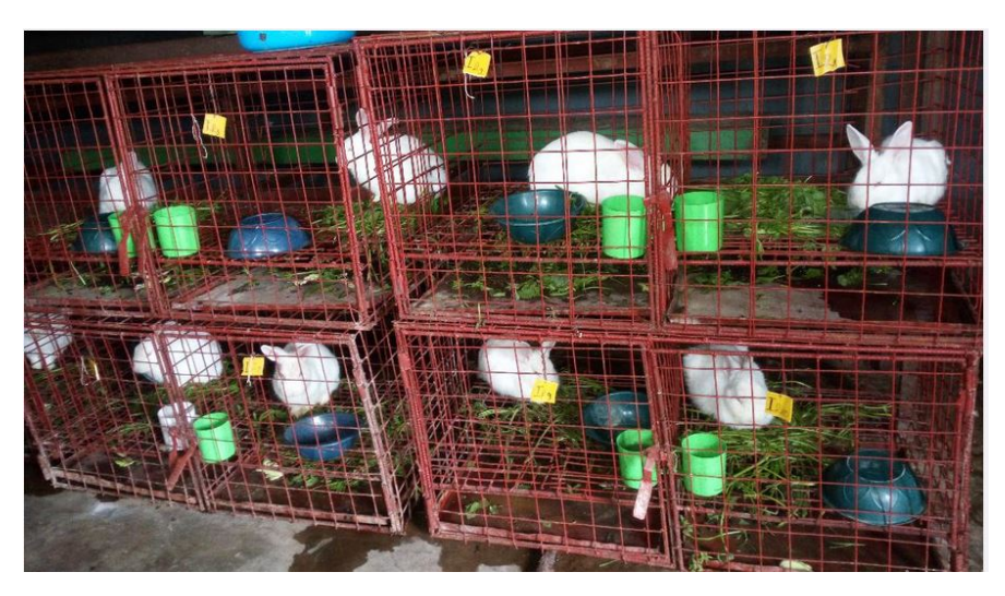
Figure 1. New Zealand experimental rabbits in cages.

of feed (500 grams) was equally distributed to all rabbits per day for all treatments. There were three treatments replicated ten times, as each rabbit was considered a replicate. These included three types of feeds namely; cabbage combined with Mucuna pruriens added to local forage (I), cabbages combined with Leucaena leucocephala added to local forage (II) and a control composed of other varieties of locally available forage, such as Bidens pilosa, Crassocephalum vitellium and Galinsoga parviflora (III) which was considered as the control (Farmers practice). Rabbits were weighed (in grams) on weekly basis using a weighing scale to study rabbit growth and data were collected for 12 weeks.