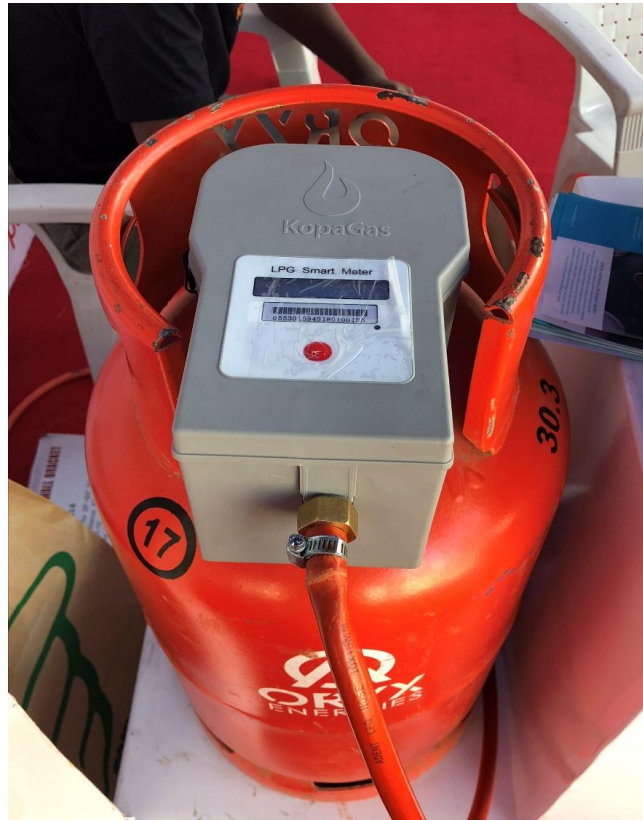
Figure 1. LPG smart-metre fixed to the gas cylinder.

The use of smart meters is said to address challenges presented by the conventional way of LPG usage, mainly cylinder acquisition and refilling charges. Nevertheless, Pay-as-you-Cook has barely penetrated to reach the targeted populations as expected despite its existence of about six years in the market. This paper evaluates the practicality of Pay-as-you-Cook innovation in promoting the adoption of LPG for household cooking activities.