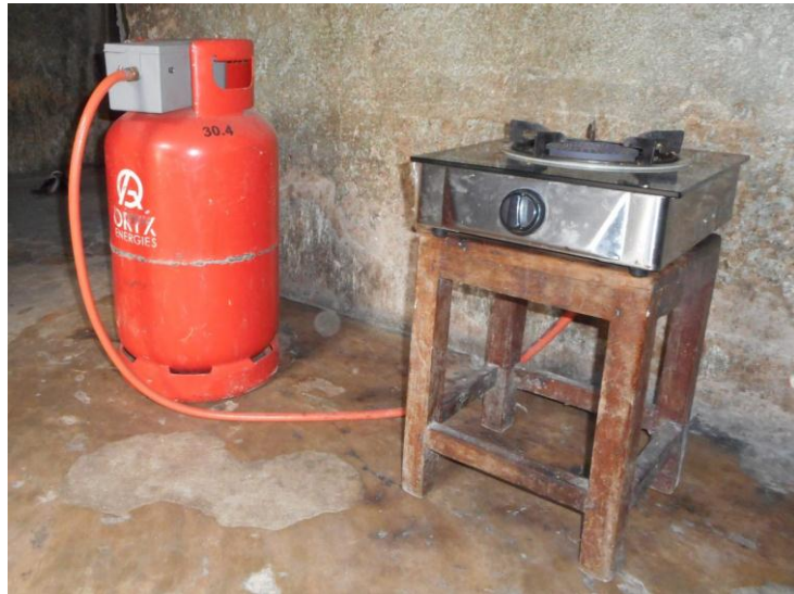
Figure 2. Pay-as-you-Cook service in a low-income household in the study area.

one of the co-founders, it was explained that a household needs only 15,000 TZS ($ 6.50) as an upfront fee to get a liquefied petroleum gas (LPG) cooking kit that includes a cylinder fitted with a smart meter. The gas supply is unlocked by mobile phone payments and the meter monitors consumption, feeding back data via the Internet of Things (IoT). It is more like Tanesco's LUKU system where electricity consumers can use their mobile phones to buy tokens to access the service.