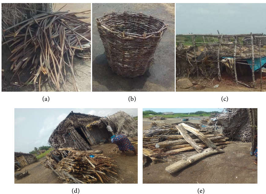
Figure 5. Mangrove wood (a) used to make leaching baskets (b), to build shelters ((c), (d)), to make fire for brine evaporation (e).