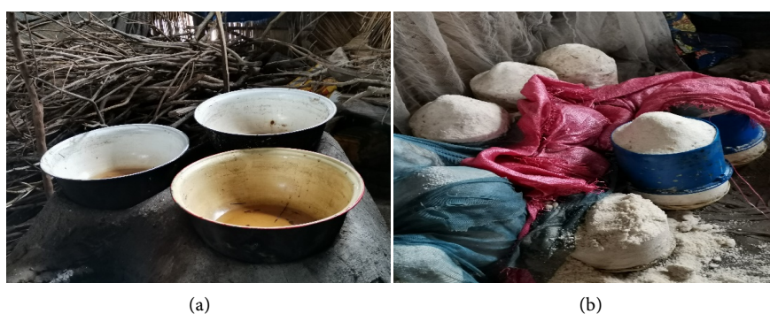
Figure 4. Photographs of salt fire-crystallized utensils (a) and a bundle of crystallized salt, ready to be sold (b). These photographs portray the poor hygienic conditions of traditional table salt harvesting in Republic of Benin.

The table salt production technic that massively contributes to the mangrove destruction in the coastal zone of Benin Republic is the one using fire wood as source of energy to evaporate the brine. From Table 1 , 82.20% of table salt producers employ wood from the cutting down of mangrove for several purposes. The leaching baskets used to obtain the brine are made out of mangrove ( Figure 3(a) for empty baskets, and Figure 3(b) for loaded basket). Figure 5 depicts the type of mangrove used to make leaching baskets Figure 5(a) , the basket Figure 5(b) . Mangrove wood is also used to construct the shelters ( Figure 5(c) , Figure 5(d) ) and to evaporate brine ( Figure 5(e) ). A substantial reduction in mangrove