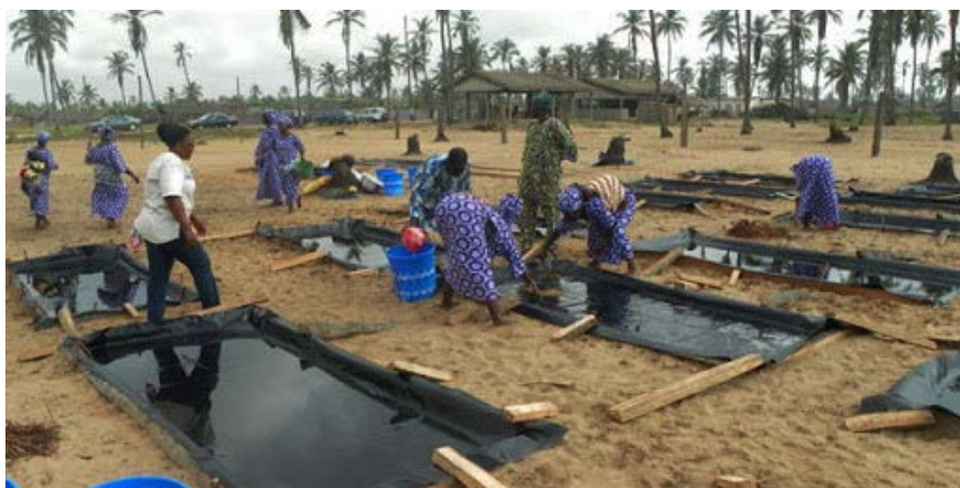
Figure 2. Photograph of women Association of Sèmè-Okoun installing the salt production plant which's fundamental component is the black tarpaulin held by woodbin.