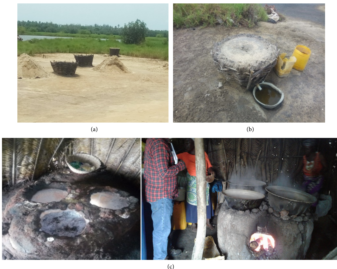
Figure 3. Photo 2: (a) Salty sand collecting field at Djègbadji; (b) Extraction of salt water by leaching salty sand; (c) Preparation of salt at Djègbadji (Ouidah)/usage of three-burner ovens.

Women salt producers not only face several health issues such as headaches, muscle and lumbar pain, fevers, cough, etc., but also the hardship of the activity (clearing of marshy sites, scraping and collecting salt sand, filtering), prohibitive prices for bundles of fire wood and low prices of the produced salt.