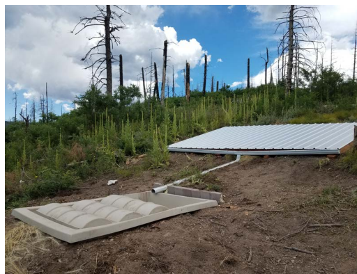
Figure 3. The final cistern installation at the ranch. The collector at far right collects rainwater and transfers it to the cistern, center of photo.