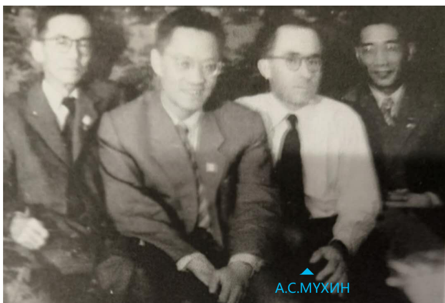
Figure 2. Group photo of Chinese planners and Soviet expert, A.C.МУХИИ (the second person from right) (Li, 2019).

Soviet experts pointed out that the preliminary preparation is insufficient, and it is necessary to offer the urban economic development vision, current situation map. After that, Soviet experts commented and guided the current situation map, green space layout, road design, industrial and residential layout in the draft plan. Furthermore, they focused on explaining some blocks layout patterns and spatial design methods. Finally, Soviet experts specified the content and relevant requirements of the planning drawings, planning description and other