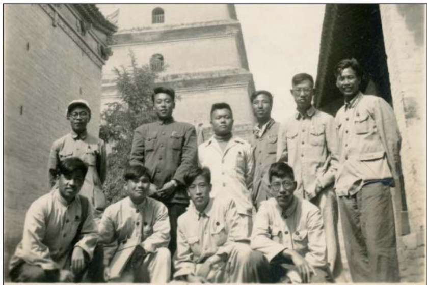
Figure 1. Photo of the staff of the Xi'an Planning Working Group in 1953 (Li, 2019).

However, only two civil and hydraulic engineers from the Municipal Construction Bureau are responsible for the planning and design. Because of lacking special urban planning knowledge and experience, they had to formulate more than a dozen drafts by imitating the urban planning of the United Kingdom, the United States, and Japan, but its planning principles and skills are quite incorrect. For example, mixing with industrial and residential areas, only focusing on commercial areas, without necessary parks, green spaces, streets, squares and systematic. From 1951, Xi'an government asked the Central Finance Committee for instructions, invited Beijing Metropolitan Committee and Tsinghua University professors for some advice, but it did not bring good results (Urban Construction Committee of Xi'an Government, 1954a). From this, we can infer that Xi'an