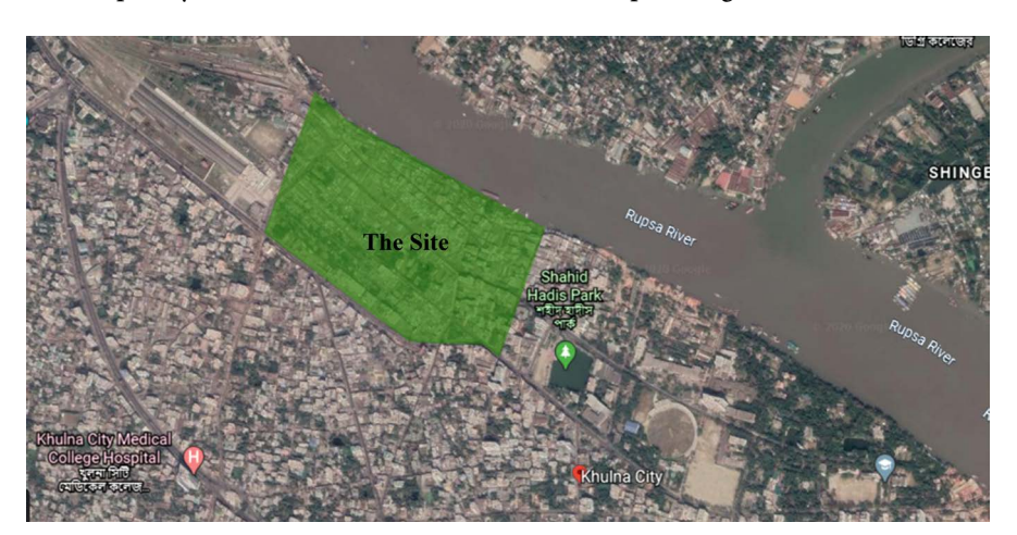
Figure 2. Study area.

Contemporary Sustainable urban revitalization and planning considers the visions