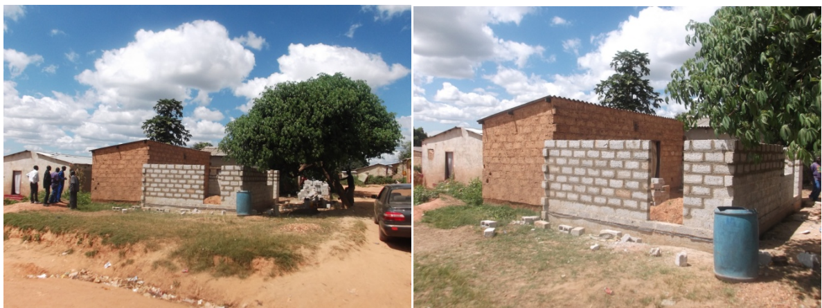
Figure 4. Showing a dwelling being extended after the owner obtained an occupancy license.

The Ng'ombe participatory slum upgrading project involved all relevant stakeholders in all stages of the project; the local coordinating organization (HUZA); the State through the Lusaka City Council; the international donors and the local community. HUZA, being a small NGO with limited funds, was determined to empower the diverse set of residents with the idea that it was within their power to improve living conditions in their settlement. HUZA thus developed a people centred community participation strategy. The community participation approach implemented by HUZA relied on limited resources that were made available by NORAD, NBBL and NORCOOP, which was no more than US$200,000. To deliver the improvements of the scale achieved in, Ng'ombe, HUZA had to stick to the priorities identified by the residents of Ng'ombe. HUZA thus focused on creation of community institutions to provide leadership and ensure sustainability of the improvements. Other areas of focus were improvement of access to health service, clean water supplies, provision of practical skills and micro credit. These sought to improve the livelihoods of the residents in order to guarantee the sustainability of the improvements, as well as to reduce vulnerability and human suffering that goes with extreme deprivation. Direct participation of all the residents in the upgrading activities was also necessary to guarantee ownership and sustenance of the intervention. It was also regarded as an insurance