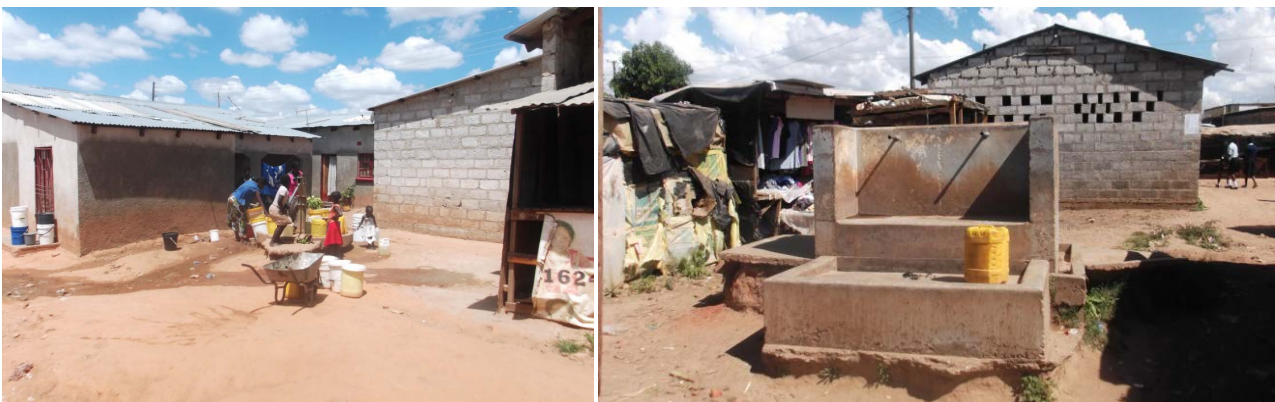
Figure 3. A borehole hand pump and disused water stand managed by the water trust in New Ng'ombe constructed during the upgrading process.

Most respondents were satisfied with the spatial conditions in the settlement (88.9%). Respondents noted that there was adequate space for domestic and public activities such as crop cultivation, trading and food preparation. The respondent unsatisfied with the spatial environment tended to be located in the Old Ng'ombe part of the settlement which is plagued by environmental challenges due to the limited upgrading in this part of the settlement from inception.