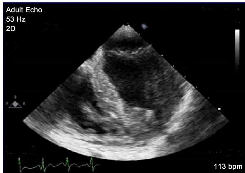
Figure 3. DE, TEE, 4 chamber view, showing 2 masses attached to both sides of the interventricular septum.