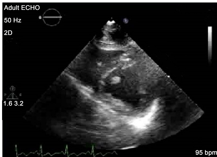
Figure 1. 2DE, TTE, short-axis view, showing 2 masses attached to both sides of the interventricular septum. The words in the figures are Adult Echo, Hz number, beat per minute (bpm).

Pulse: 120/min. BP 110/70. Auscultation: unremarkable. Electrocardiogram (ECG): sinus tachycardia, VPBs (ventricular premature beats). Holter monitor: revealed frequent multifocal VPBs, attacks of nonsustained ventricular tachycardia (VT). She was referred for Echocardiography transthoracic (TTE) and transesophageal (TEE) ( Figures 1-4 ). PET scanning was not done. Magnetic resonance imaging (MRI) was not done.