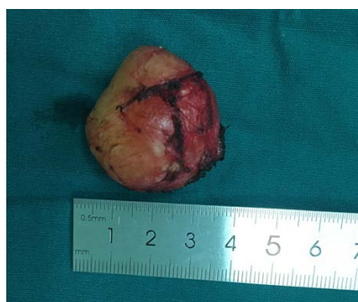
Figure 2. The tumor was completely dissected during the operation.