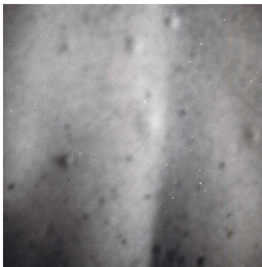
Figure 1. Cutaneous myxomas.

Biochemical and hormonal evaluations demonstrated high values of blood GH concentrations (40 ng/ml). A transsphenoidal endoscopic surgery was then performed in August 1996. The postoperative period was complicated by a severe dyspnea attributed to obstructive macroglossia. The histologic examination led to the diagnosis of “GH-secreting pituitary macroadenoma”.