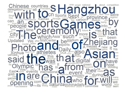
Figure 2. Word cloud of the retrieved 45 reports.