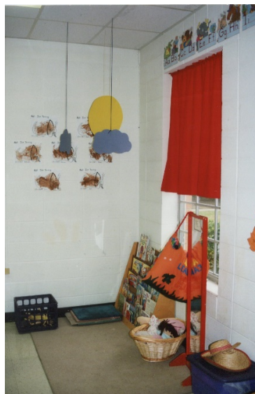
Figure 15. Space for book reading and sharing activities.