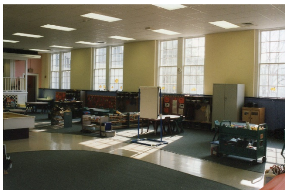
Figure 6. Space for indoor physical activity.