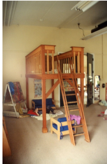
Figure 24. Loft design with large scale lower level.