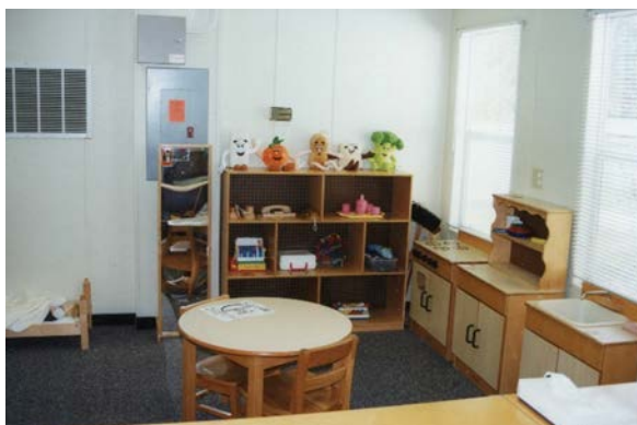
Figure 5. Space for activities selected by children.