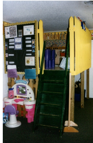
Figure 22. Loft design with contrasting colors.

of this design. Figure 23 shows a natural wood design with sloped and carpeted stairs for access. Seating is provided on both the upper and lower levels of the loft. This design has overhead electric lighting with well-designed and safe access. The ceiling height in the center for Figure 24 is high, therefore, allowing for a higher upper level for the loft design than seen in the other loft design examples. This loft is designed with rectilinear form, natural wood, and a sloped ladder. Electric and natural lighting are seen for both levels. The open level below is an affordance for movement. However, this loft does not provide children with a separate area for privacy. Figure 25 shows a loft design with a book reading and looking area on the upper level. The lower section is separated with fabric to offer children a separate area for play. The multicolored guardrails or balustrade creates a focal point in the space for exploration. The area is dark with limited electric lighting. Figure 26 shows a large cardboard box painted with a bright orange hue with a cutout for a door. This option is an inexpensive approach to add large form variation in the space with an option for children's privacy.