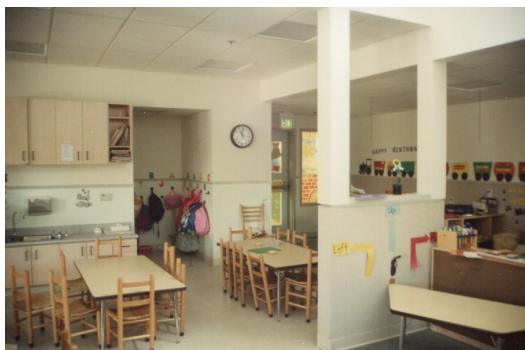
Figure 3. Space for activities selected by children.