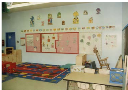
Figure 11. Space for singing/rhyming activities.