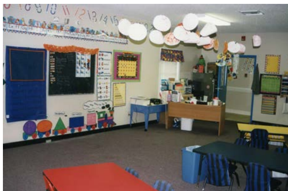
Figure 10. Space for singing/rhyming activities.