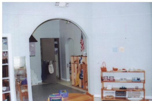
Figure 2. Space for activities selected by children.