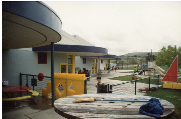
Figure 9. Space for outdoor physical activity.