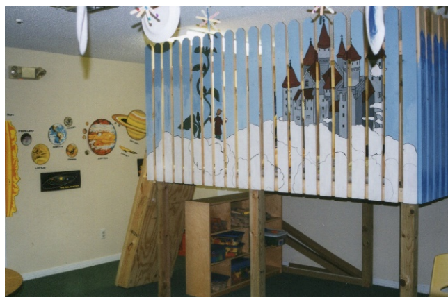
Figure 18. Loft design with a landscape painting.