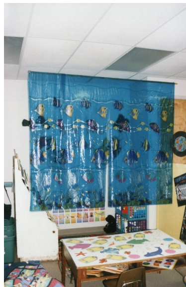
Figure 4. Space for activities selected by children.