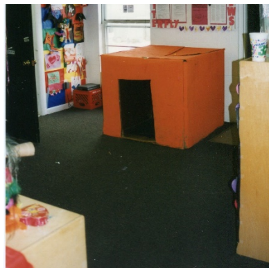
Figure 26. Cardboard structure for play.