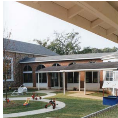
Figure 8. Space for outdoor physical activity.