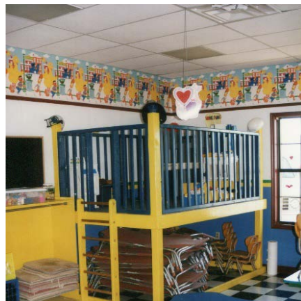
Figure 17. Loft design with different colors.

Figure 17 shows a loft design located in the center of the space with natural and overhead lighting. The lower section offers children a deep area for movement. The ladder is vertical which is not the ideal design for access to the upper level. The safest design of the steps for balance is at an angle with handrails, as is true for all ladders. Figure 18 shows a painted design of castles in the snow on the second level. One disadvantage to this design is the view from the upper level with the wide picket boards. Figure 19 shows a dramatic play level on the lower section of the loft. The loft is located in the corner of the space with the stairs next to the wall which is a safe design for young children when climbing to the second level. Additionally, the loft is painted blue which contrasts well with the light walls. This loft is similar to Figure 18 with a painted element on the vertical boards. It is easier for children to look down and caregivers to see in to the second level with this loft design because of the separation between the vertical boards.