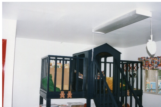
Figure 21. Loft design with variation of form.