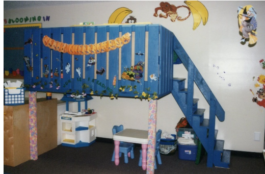
Figure 19. Loft design with dramatic play area.

Figure 20 shows a loft designed of natural wood. The form shows a rectilinear design with seating on the upper level. The lighting for this loft is overhead without natural lighting. The loft in Figure 21 shows variation of form with a gable and arch form in the center of the design on the second level. Additionally, the dark blue color adds a clear contrast to the neutral color on the walls. One negative feature of this design is the close ceiling height for proper lighting and volume in the space. Figure 22 illustrates a loft design with contrasting colors and a sloped stair design. Additional electric lighting would enhance the second level