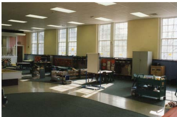
Figure 1. Space for whole group activity.