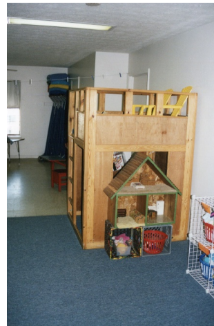
Figure 20. Loft design with natural wood.