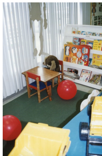
Figure 14. Space for book reading and sharing activities.