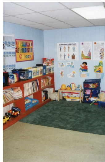
Figure 13. Space for book reading and sharing activities.

Figure 13 illustrates a carpeted area with bookshelves. This is a space with red, blue, and green. The colors complement each other. Additionally, the texture of the carpet reduces the acoustic noise from the rest of the center with a smooth surface flooring. In Figure 14 , a table with chairs is provided for children who want to look at books. The book area is designed with natural lighting which is controlled with vertical blinds. Figure 15 shows a pleasant corner book area with carpet and controlled natural lighting. In Figure 16 , the reading area is designed with child-scaled upholstered furniture, creating a social area for book looking and reading. This would encourage book sharing and conversation among children. Natural lighting is also prevalent in this layout. These options show different layouts with textures, color, form, and lighting.