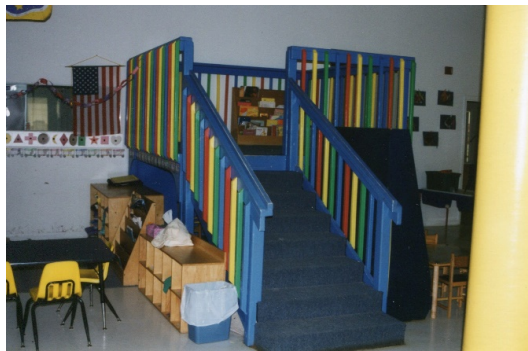
Figure 25. Loft design with bright hues and a carpeted staircase.