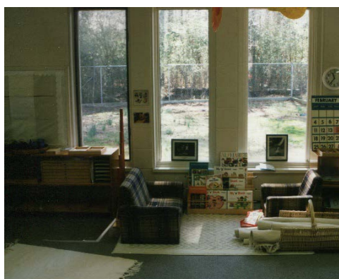
Figure 16. Space for book reading and sharing activities.

The design recommendations and time spent in children's different activities show specific examples of best practices in early childhood education centers. Teachers, care providers, and directors at centers have flexible options for incorporating exceptional design elements within the setting.