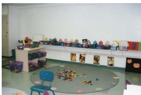
Figure 12. Space for singing/rhyming activities.