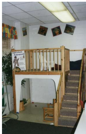
Figure 23. Loft design with natural wood and sloped stairs.