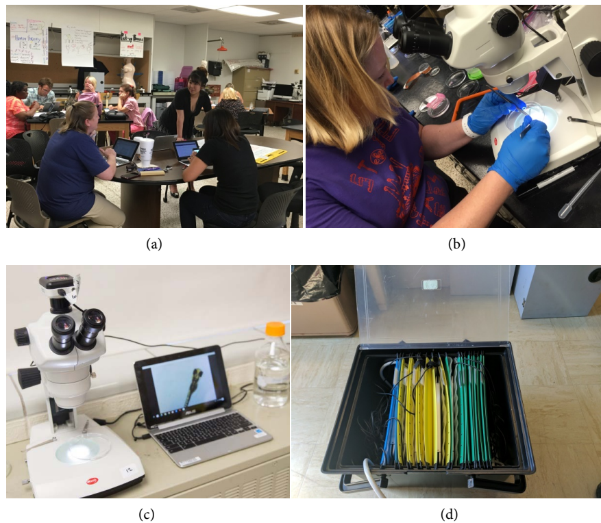
Figure 1. Photos of technology utilized during professional development. (a) Teachers utilizing Chromebooks in classrooms; (b) Teachers utilizing Motic microscopes equipped with WiFi cameras; (c) Motic microscope equipped with WiFi Camera and connected Chromebook; (d) Chromebook storage box.

life (more than 8 hours), relatively low cost (under $200 at the time of purchase), a wide range of capabilities, and touchscreen and tablet functionality while also maintaining a usable keyboard for typing. In addition, their ready connection to the Google Classroom class management system and the microscopes used in the program made them attractive for use in this situation.