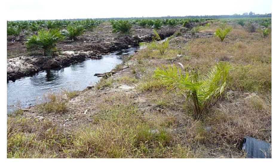
Figure 20. Difference between palms with (left) and without (right) OrganiGro treatment