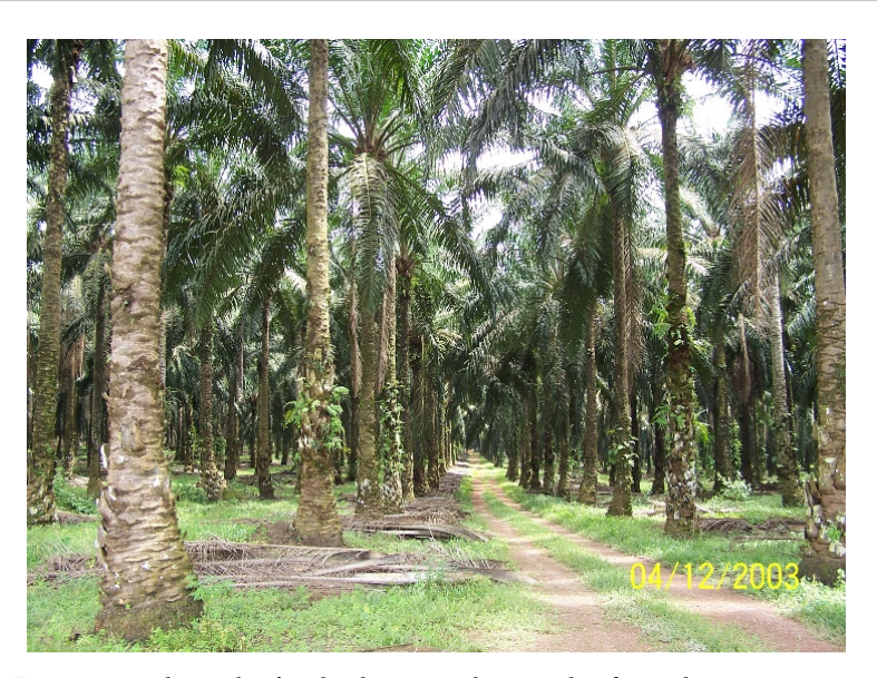
Figure 4. Guthrie Siliau's oil palm estate that was due for replanting in 2003.