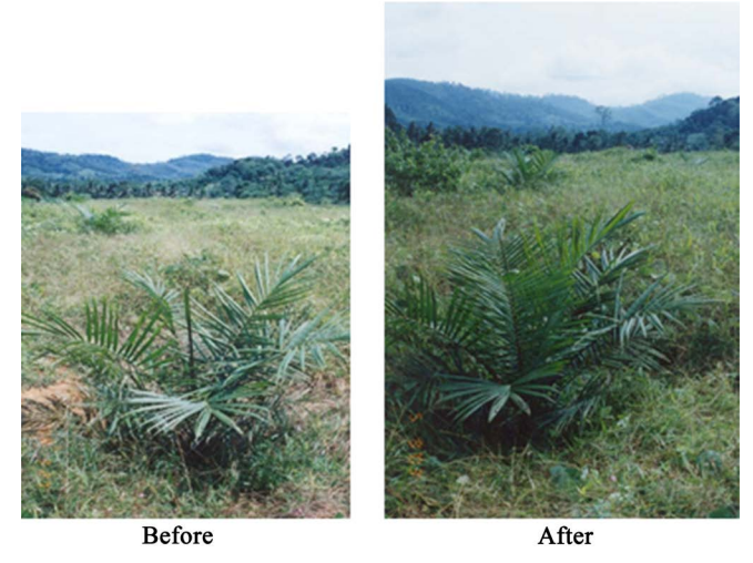
Figure 16. Before and after states of a newly transplanted palm treated with OrganiGro.

palm that was newly transplanted. The picture on the right shows the results of two weeks of treatment with OrganiGro. Visible improvements could be seen in leaf coloration and health appearance of the palm.