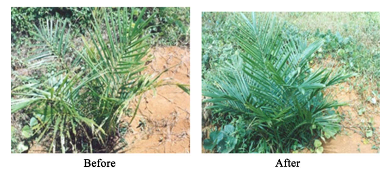
Figure 17. OrganiGro's impact on a seedling that was heavily infected by pests.