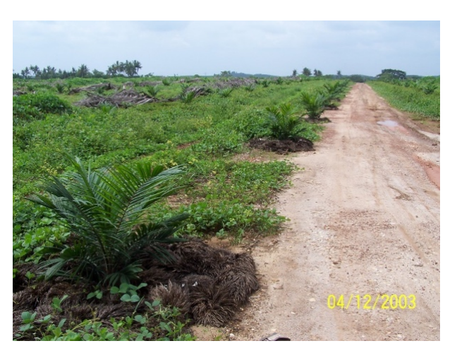
Figure 6. Young palms planted on hardpan grew well when treated with OrganiGro.