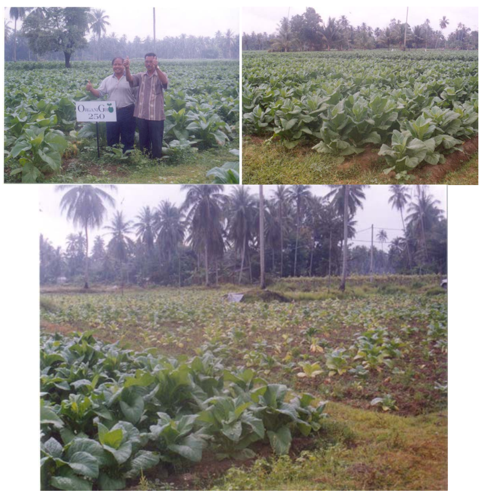
Figure 23. Comparing tobacco plots with (left) and without (right) OrganiGro treatment.

In the years when the Malaysian government was reducing tobacco cultivation under the pressure of anti-tobacco lobbying, and encouraging farmers to plant alternative crops instead, the government only subsidised one tobacco season as opposed to two seasons per year earlier. Since OrganiGro could double the farmers' yield, they retained their yearly income even though they can now only plant tobacco for one season, and made extra income from planting watermelon in the next season.