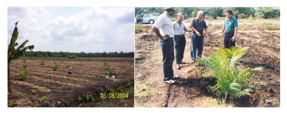
Figure 8. This oil palm plantation was developed on peat land. Palms had poor growth due to insufficient copper, zinc and Ganoderma attack.

OrganiGro was applied to some of the young palms (Figure 8 and Figure 9) and a massive difference was observed between them and the control (Figure 10). Imbalances in nutrient uptake, especially in the early stage, stunted the palm