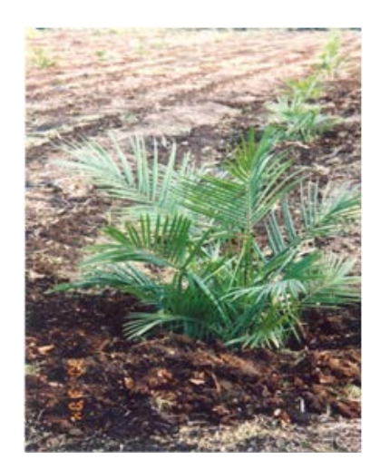
Figure 9. OrganiGro applied.