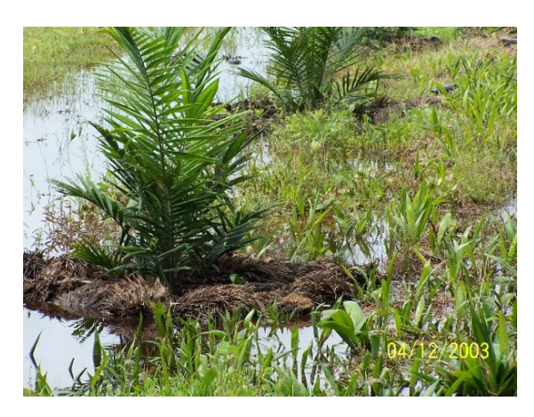
Figure 7. Young palms treated with OrganiGro grew well despite being subjected to abiotic stress.