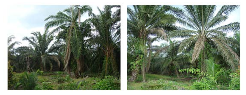
Figure 14. Surrounding area that was heavily infested with Ganoderma.