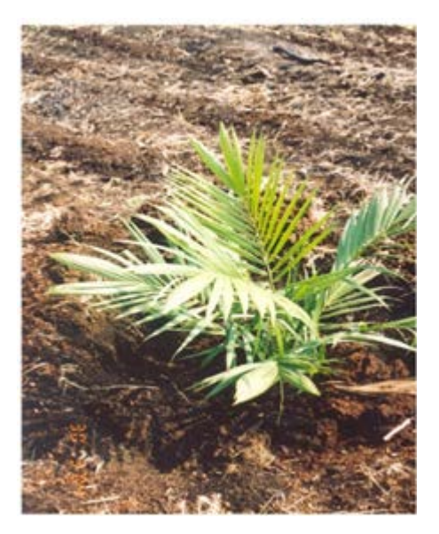
Figure 10. Without OrganiGro (control).

The picture on the left in Figure 16 shows a stunted and poorly developed