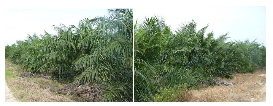
Figure 19. Difference between palms with (right) and without (left) OrganiGro treatment.

the control field in the right segment of Figure 20 was in contrast with the green and even growth on the block treated with OrganiGro on the left of the picture.