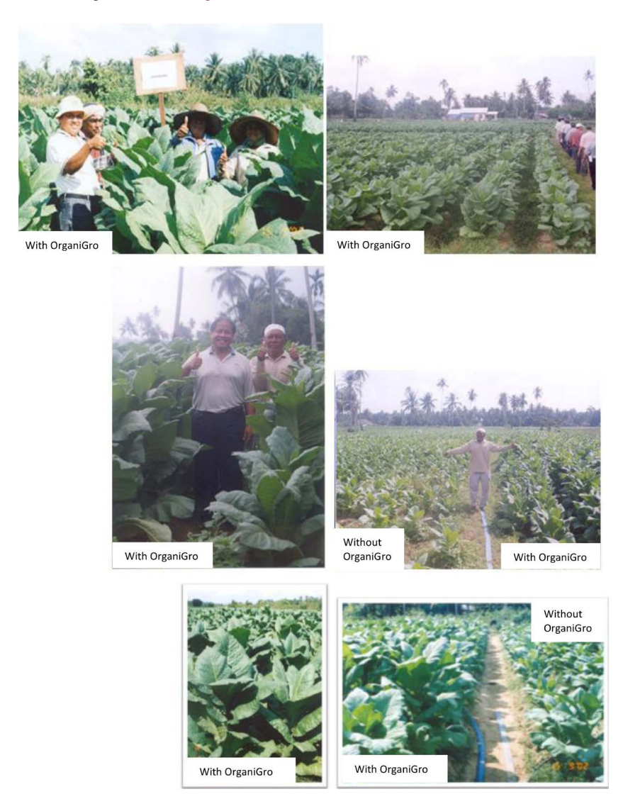
Figure 22. Comparison of tobacco plots with and without OrganiGro treatment.

The late Ismail Daud started using OrganiGro in 2002 and immediately saw results. The usual harvest was around 800 kg of leaves per hectare per season, which was not a good average yield. This could be attributed to a disease called Fursarium wilt. The farmers doubled their yield to 1700 kg per hectare after using OrganiGro. Ismail was comparing his plot (with OrganiGro) and his neighbour's (without OrganiGro) in Figure 22.