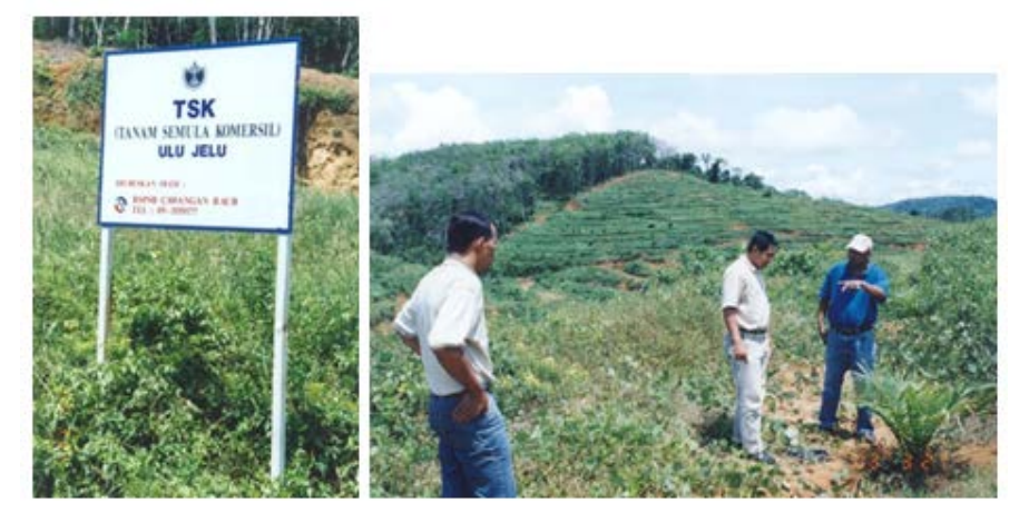
Figure 15. Visit to RISDA Raub's plantation in Ulu Jelu.