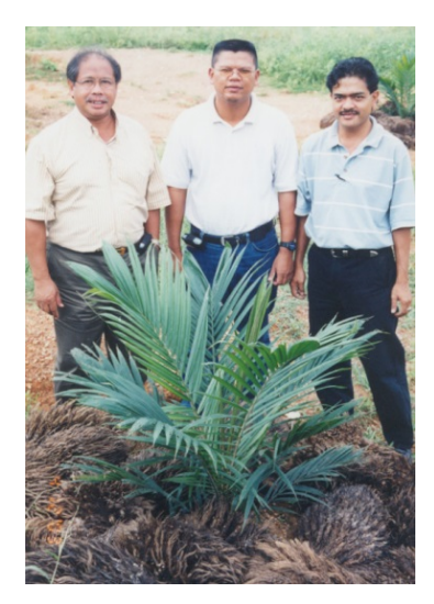
Figure 5. A young palm tree growing well in a planting hole enhanced with OrganiGro.