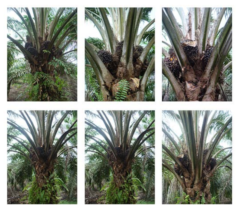
Figure 13. Ganoderma infested plot treated with OrganiGro seven years earlier.