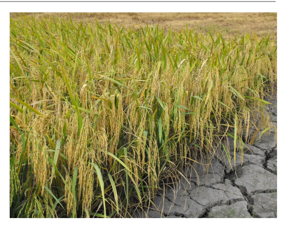
Figure 3. Paddy was still growing well even when more than two weeks of dryness had caused the land to crack.