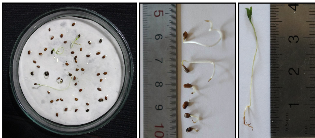
Figure 3. Laboratory germination of the seeds of Lonicera tatarica .