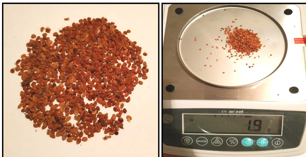
Figure 2. Seeds of Lonicera tatarica in the conditions of the Tashkent Botanical Garden.

To determine the germination of seeds in laboratory conditions, they were grown and examined 3 times at temperatures of +20°C + 22°C, +24°C + 26°C and +28°C + 30°C. The optimal temperature for seed germination in laboratory conditions was +20°C + 22°C, at which germination was 73%, at +24°C + 26°C - 66%, and at +28°C + 30°C - 14% (Figure 3, Table 1).