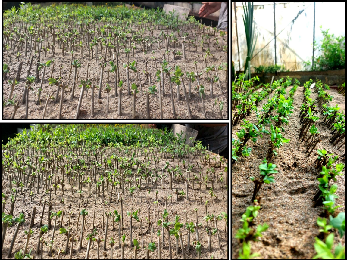
Figure 5. Vegetative reproduction of Lonicera tatarica by cuttings in greenhouse conditions of the Tashkent Botanical Garden.

constituents from the leaves of Lonicera japonica studied by Yu et al. [15].