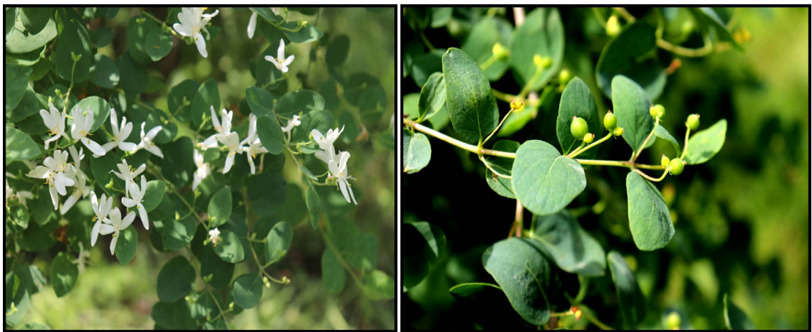
Figure 1. Lonicera tatarica in the growing conditions of the Tashkent Botanical Garden.

The development of plant seeds is one of the main indicators that determine the reproduction and renewal of seeds, and the viability of the species determines the quality of the species.