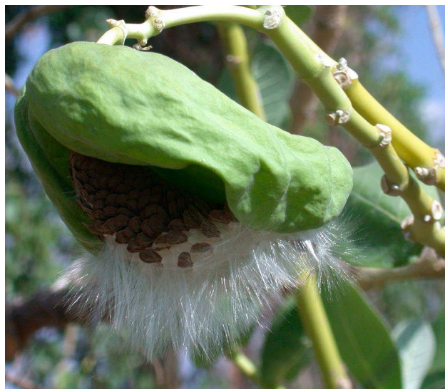
Figure 4. Calotropis procera Aiton (Tuft Seeds).