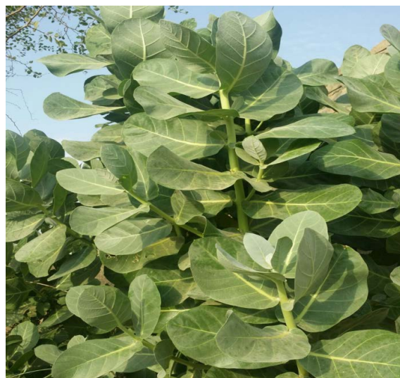
Figure 3. Calotropis procera Aiton (Stem & Leaves).

The milky sap contains a complex mix of chemicals, some of which are steroidal