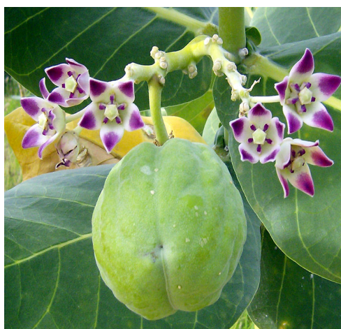
Figure 2. Calotropis procera Aiton (Flowers & Fruit).