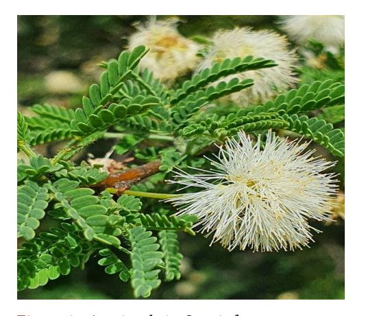
Figure 3. Acacia etbaica Scweinf.