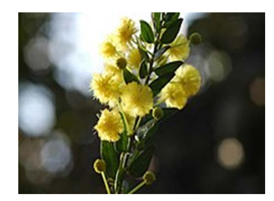
Figure 5. Acacia hamulosa Benth.