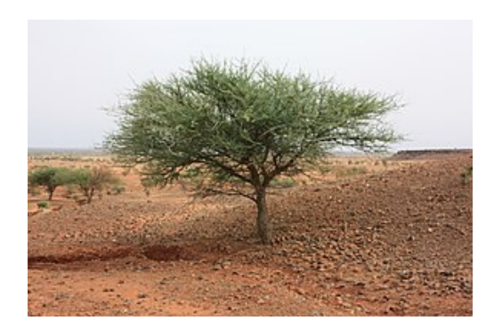
Figure 4. Acacia laeta R.Br. ex Benth.