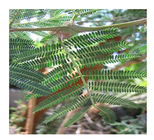
Figure 7. Acacia seyal Del.