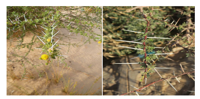
Figure 1. Acacia ehrenbergiana Hayne.

Dicot, Tree or Shrub; Trunk distinct with flattened or crown in older trees; Bark pale brown, brownish-black, reddish-grey or dark grey, smooth or fissured; spines in pairs at the nodes, Brownish-white; slash fibrous and creamy white; twigs red brown. Leaves have (1 - 9) pairs; leaflets in (4 - 35) pairs. Inflorescence capitated on axillary peduncles. Flowers white or creamy; Calyx (0.4 - 1) mm. along; corolla (2 - 3) mm along. Fruit legume, purple-brown to red brown, shiny, straight; seeds about (8) brown or olive-brown, flattened.