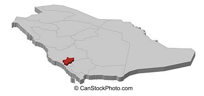
Map 1. Saudi Arabia with Al Baha highlighted.

The climate in Tihama area is different from that in Al Sarat although they are separated by no more than (25) Km. Relative humidity varies between (52% - 67%) with maximum temperature of (23°C) and minimum temperature of (12°C). The average throughout the whole region is (100 - 250) mm. annually. The climate of Al Baha city is mild with temperature between (10°C - 40°C) due to its location at (2500) m. above the sea level. Thus, the climate is moderate in summer and cold in winter (Graph 1).