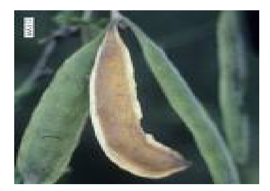
Figure 6. Acacia oerfota (Forssk.) Scweinf.