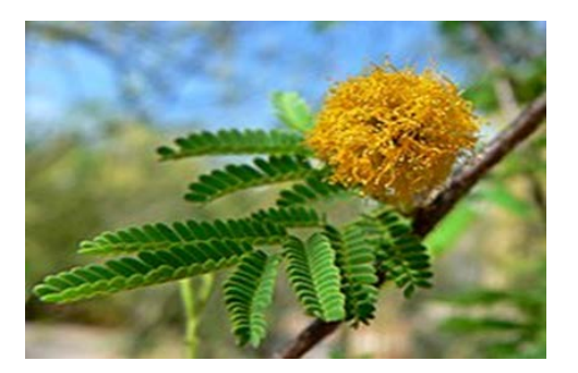
Figure 2. Acacia johnwoodii Boulos.