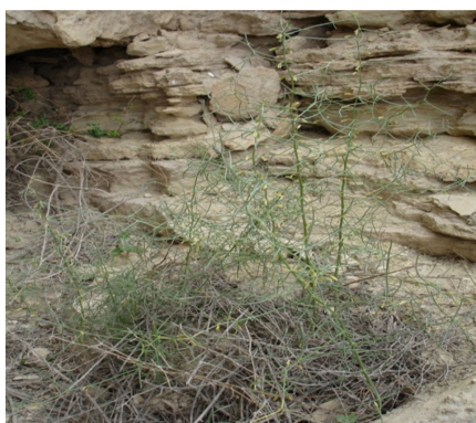
Asparagus turkestanicus Popov