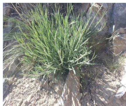
Silene tomentella Schischk