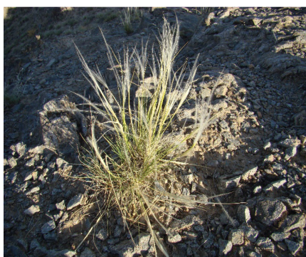
Stipa aktauensis Roshev