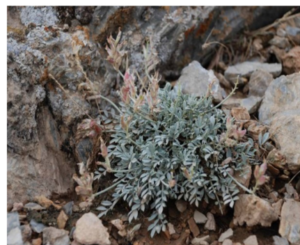
Astragalus holargyreus Popov