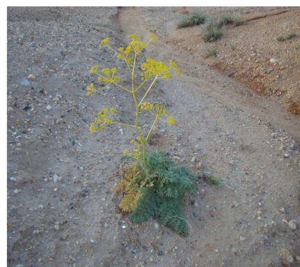
Ferula kyzylkumica Korovin