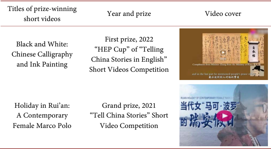
Table 6. Two prize-winning short videos in our study.

(see Table 6 ). China’s first “HEP Cup” of “Telling China Stories in English” Short Videos Competition was held in 2022 by the National Institute of College Foreign Language Teaching, with the theme of “Me and Intangible Cultural Heritage in My Eyes”. Among the eight first prize winners of short videos in this activity, we selected “ Black and White: Chinese Calligraphy and Ink Painting ”, which introduced Chinese calligraphy, one of the most famous intangible cultural heritages in China. This video was produced by Chinese university student group and conveyed Chinese culture from the perspective of Chinese people. “Tell China Stories” Short Video Competition has been held by China Foreign Language Administrations since 2019. The competition is open to all nationalities and many prize winners are international netizens who like to make videos telling China stories. Among all the grand prize winners, we selected “ Holiday in Rui’an: A Contemporary Female Marco Polo ”, which introduces the diversified intangible cultural heritage in Rui’an city and expresses the author’s hope for promoting cultural exchanges between China and Italy.