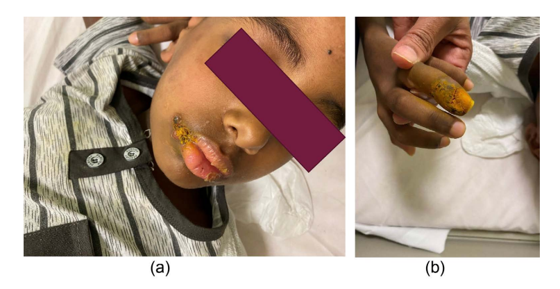
Figure 2. Turmeric application as shown on the affected lesions.