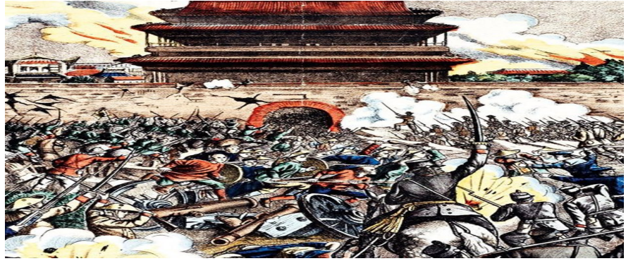
Figure 1. The 1900 Boxer Rebellion and Foreign Invasion (2008). The image speaks volumes about the struggles and wars that were faced during the boxer rebellion. It visually expounds on what transpired during the Boxer's rebellion towards foreigners that happened in China in 1900. People started it but subsequently funded it by the state. To get rid of the foreigners, a Chinese sect dubbed the Boxers launched a violent expulsion campaign. Countries from across the world sent in soldiers to stop the violence (Eight-nation Alliance).