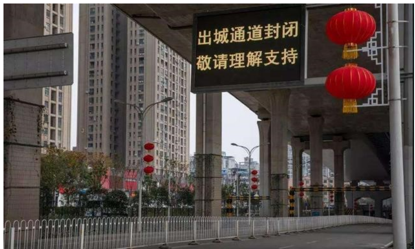
Figure 5. Streets in china during the lockdown (2022). To manage the fast-spreading Covid-19, the China government imposed a lockdown that required everyone to stay at home. The image shows the clear and empty streets in Wuhan, China, when the mandatory lockdown was enforced. To facilitate the epidemic prevention work, the government of China temporarily blockaded the city in early 2020.