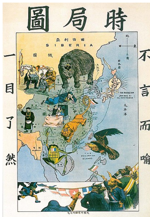
Figure 2. The Situation in the Far East (National Archives and Records Administration, n.d.) (Shijutu). The image made by Tse Tsan-tai satirized western powers' encroaching on China. The author points out foreigners' wild ambition of ruling over China as "clear at a glance" and "self-evident". It also shows the weakness and corruption of the Qing Dynasty (the Chinese government of the day), warning Chinese people to strive to rejuvenate their nation.

Although the Boxer Rebellion ended in a fashion that seemed or felt like a defeat to the Rebellion and the Qing dynasty, the rebels achieved what they wanted. They showed the allied nations that directly colonizing China's people would be a challenge. Therefore, the foreigners abandoned original plans of colonizing China directly. Instead, they opted to manipulate the Qing dynasty leaders like Empress Dowager Cixi because it was easier to deal with these people's government. The Chinese public was seeing the manipulation, and as a result, the ruling Qing elites were being challenged by both internal forces (i.e. the Chinese public and revolutionary parties) and external forces (i.e. the allied forces), which led to a gradual weakening of the Qing dynasty as the central authority in China. In 1912, the Qing dynasty collapsed following its gradual deterioration since the 1901 Boxer Protocol (please see Figure 2 and Figure 3).