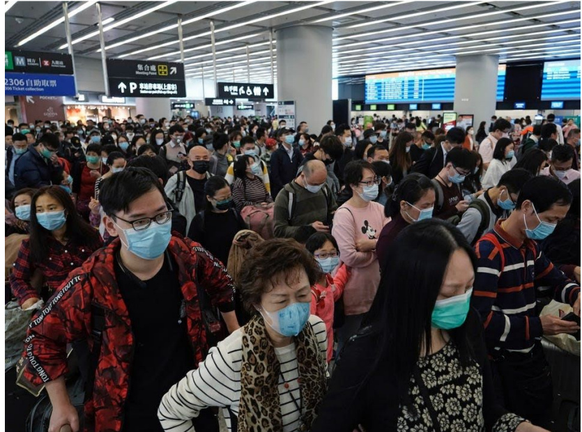
Figure 4. Chinese residents wearing mask as a control measure (Kin, 2020). During the Covid-19 prevention initiatives, the Chinese Government required everyone wear face masks to prevent the spread of the deadly virus from one person to another. Mandatory putting on of the facemasks in public places is one of the collective measures that the government of China imposed to manage the crisis.

cities. This was arrived at and issued the day before the Chinese festival of spring to limit the extremely population mobility, minimizing the disease's transmission. This announcement was made. In addition, all shops apart from the ones that sold food and medication were closed, and rigorous quarantine measures were imposed (please see Figure 5 ).