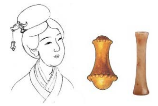
Figure 5. "Ear clan" of Han Dynasty (Li, 2015).