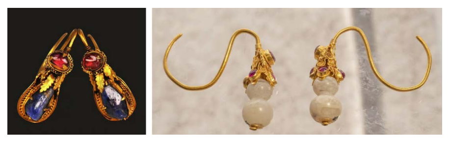
Figure 8. Example of typical earshape in Ming Dynasty.