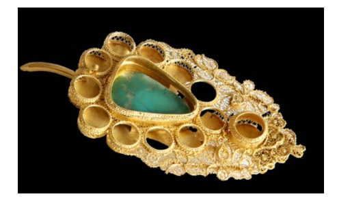
Figure 7. Example of typical earshape of Yuan Dynasty.

"One ear and three pincers" ("three earrings on one ear") is a unique earrings shape system of the Qing Dynasty, and its evolution more reflects the integration of Manchu and Han ethnic culture and aesthetics. At first, "one ear and three pincers", namely wearing three ear holes in one ear (Figure 9), was the practice of the Manchu rulers of the Qing Dynasty, thus symbolizing auspicious luck, which was a tradition that Manchu women must follow when they were