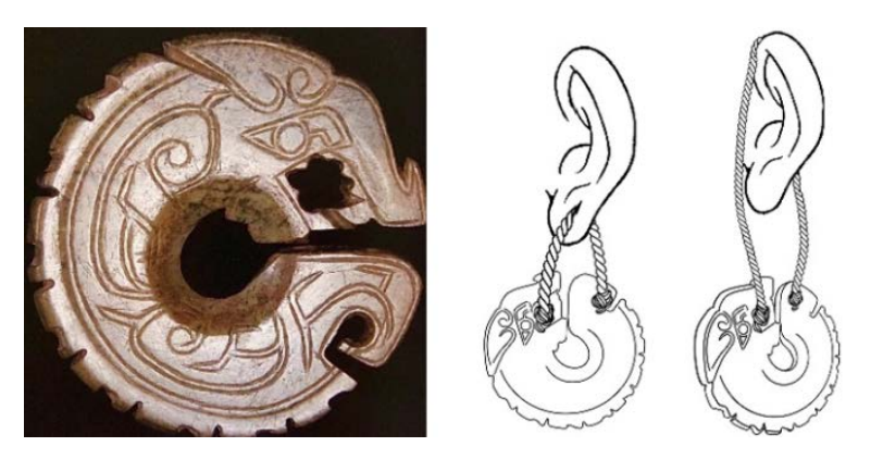
Figure 3. Typical earshape and wear of Shang dynasty.