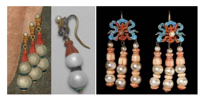
Figure 9. typical typical ear ear earrings in the Qing Dynasty.