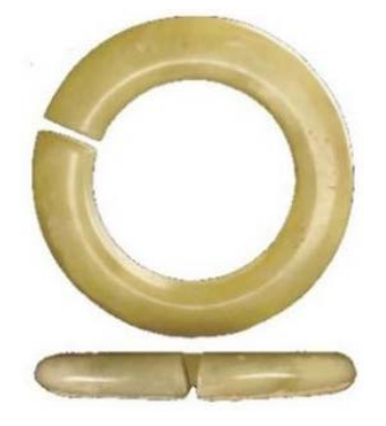
Figure 1. A typical prehistoric earrings with a "jade ring" (Fang & Zhou, 2004).