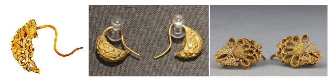
Figure 6. Example of typical earshape in Song Dynasty.

with exquisite concrete carrier, and seek the connection to people's view of beauty. For example, the lotus gold earrings are taken from the natural lotus shape, and the lotus flower in the nature is endowed with the symbolic significance of moral integrity in the process of artistic image, which is conveyed through specific earrings media and symbolizes the wearer's own interests, thus forming a unified aesthetic image of subject and object. Therefore, the song dynasty earrings decoration, modelling with natural scenery as the subject, embodies the song people secularization aesthetic taste, earrings construction pay attention to exquisite real characterization, shows the song people pursuit of elegant, dignified inside collect form beauty, and the connotation of graceful poetic earrings, expression, the song people have "rhyme outside" beauty, and their own literati feelings.