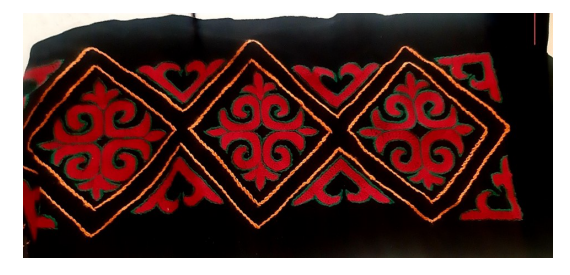
Figure 3. Embroidery for decorating supporting pillow.

arts fruitful ways offer to engage students in school classroom (Braund & Reiss, 2019). School lessons in learning lace, knitting or embroidery will eventually develop girls' professional activity and can become the income source; these skills will remain "family helpers" for girls in their adult life (Kormilitsyna, 2013). For the effective organization of training and education, process in the girls' class based on the personality oriented pedagogical technologies (Efimenko & Tarakanova, 2014). In creating an artwork, color and form are main variables in the painting code, appealing students' emotions and skills in participating in communication (Caiman & Jakobson, 2019).