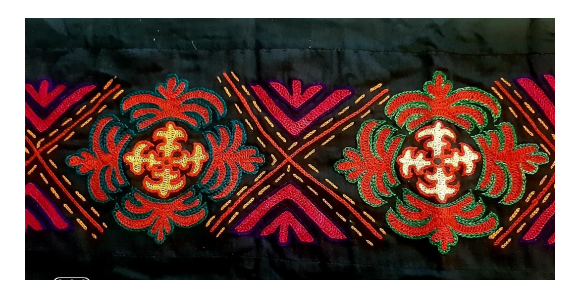
Figure 2. Embroidery used for decorating pillow.