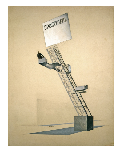
Figure 3. El Lissitzky, in the Lenin Tribune, Paper, 1920.