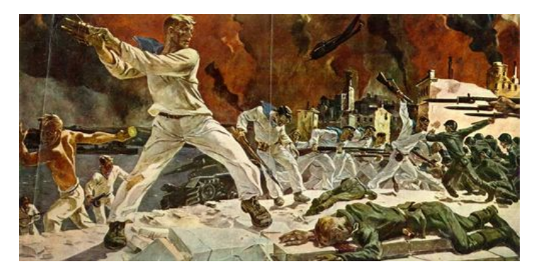
Figure 7. Aleksandr Deyneyka, Defense of the Petrograde, Oil on canvas. 1930.