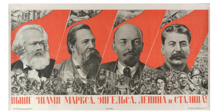
Figure 4. Flags of Gustav Klutsist, the flags of Marks, Engels, Lenin and Stalin up!, 1936.

Since the 1930s, with Stalin's attempt under the rule of the Soviet Union, the political view of respect for identity and glorification of rulers has shown its effect in the field of art. Since 1934, Social Realism has been officially recognized as the only trend in Soviet art. Artistic, social and cultural areas were now under the control of the party and the state. With the pressure of the totalitarian regime, the artists fulfilled the task of guiding the daily life of the society by describing the daily life of the society in a happy enthusiastic way through art. Based on this understanding, the artists reflected positive emotions and conveyed cheerful and hardworking characters. Workers, revolutionaries are exalted and heroized and symbolized. With this policy of encouragement, all segments of the society were tried to be directed towards socialism (Uygur, 2005: p. 6). Many painters such as Yoganson, Gerasimov, Pimenov, Korin, Konchalovsky, Vodkin, Mikayıl Abdullayev, Tagı Tagıyev, Trivagonov, Nesterov, Reshetnikov, Brodsky, Bozkov, Popkov took part in Soviet art with their works reflecting the style of Social Realism. The artists reflected the daily life of the society in their works and conveyed strong and