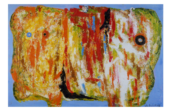
Figure 10. Elye Belyutin. Village girl. Oil painting, canvas, 1960.

Brezhnev came to power after Khrushchev. The years 1970-80 have been described as a period of stagnation. As a reflection of the recession period, stagnation was experienced in the field of art. "During this period, artists started to produce works with a new style of expression. Along with these, the Photorealism style started to spread in the late 70's. The artist named Aleksandr Shilov,