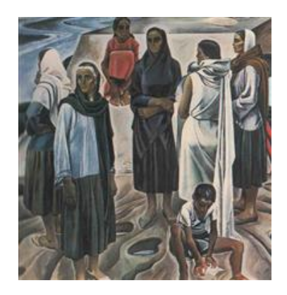
Figure 11. Tahir Salahov. Absheron's Women, Oil on canvas, 1967.

During these years, with many innovations in Soviet art, groups supporting new art movements were established. Groups contributed to the development of