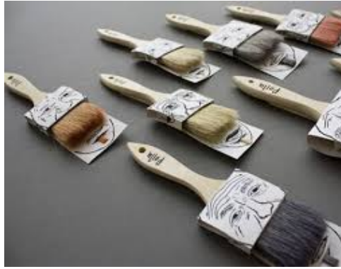
Figure 8. Packaging design as a visual communication tool.

promoting and purchasing the product is the design of the packaging (Düz, 2012: pp. 22-23) (Figure 8).