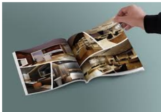
Figure 5. Magazine design as a visual communication tool.