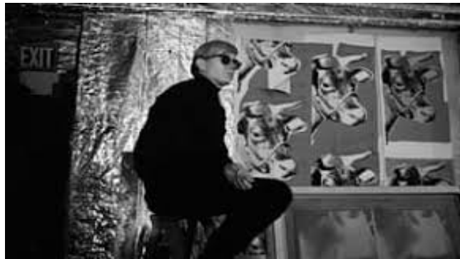
Figure 4. Andy Warhol, factory, New York.

There are very important steps before any magazine reaches its reader. The most important of these steps is to ensure that the target audience to be reached is impressed by its cover before they even read the magazine. Even though the information contained in the magazine affects the reader, first of all, it is necessary to impress with the cover of the magazine and ensure that it is purchased or curiosity. For this reason, magazine designs have always been affected by visual communication and continue to be affected.