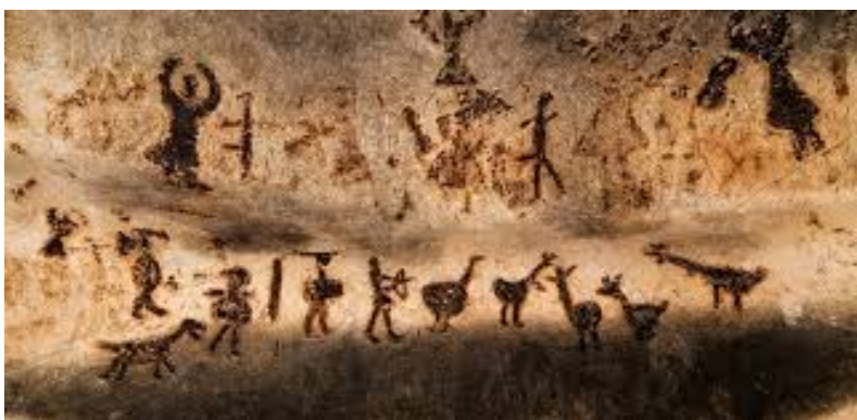
Figure 1. Animal and human figures drawn on cave walls.

When we look at prehistorical times, wild animal paintings and hunting scenes drawn on cave walls are seen in the periods when there was no literacy. These are undoubtedly the first examples of visual communication. Even though the paintings drawn on the cave walls were researched much for what purpose and what was intended, it was understood that the main purpose was to communicate and express themselves. The most important purpose in these pictures is to transmit their messages to different societies (Becer, 2011: p. 28-29) (Figure 1).