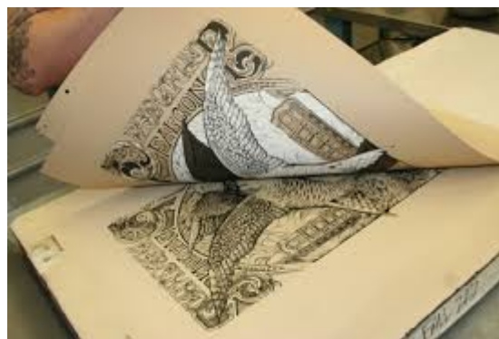
Figure 7. Illustration with lithography technique.