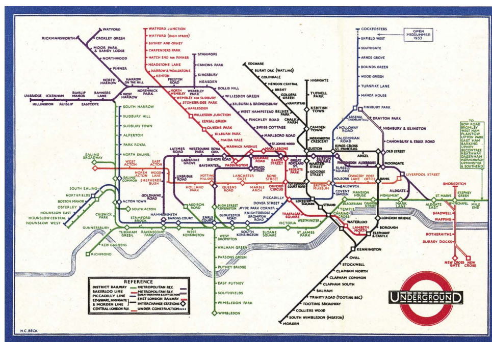
Figure 2. London metro map, Henry Beck, 1932.

Visual Communication is an important part of contemporary design that defines information communication today. Visual Communication is based on both the eye that performs the act of seeing and the brain that makes sense of all sensory information received (Lester, 2013: 5). The most important resource which focuses on Visual Communication theory is Sol Worth's book, which consists of a series of articles called Visual Communication Study. The main subject in Worth's studies and articles is the question of how meaning is conveyed through visual images. This question is still the most important in all our studies in the context of Visual Communication today. Worth defined the process of transmitting visual messages as "a social process in which signs are produced and transmitted, perceived and interpreted as messages."