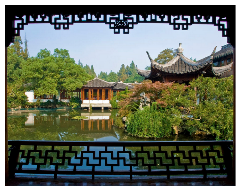
Figure 2. The buildings around the small pond.

The "Mirror Pond" area forms the north section of Guo Zhuang. A building named "Twin-sided Scenery Pavilion" (两宜轩) acts as a divider between the Quiet Life and Mirror Pond areas. The "Twin-Sided Scenery Pavilion" rises from the water, and features a wide and open terrace around, from which an excellent view of the goldfish and pink lotus is visible. The pavilion is decorated with exquisite, long windows, through which one can observe the glittering ripples and intriguing inverted images on the water: images of the moon or the clouds,