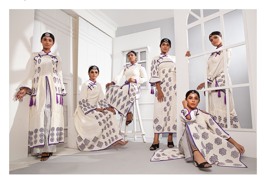
Figure 1. Khadi made modern Qipao.

Figure 1 shows the developed Qipao made by Traditional Bangladeshi Khadi fabric. The stand collar and straight pankou buttons, the silhouette like A-line, Hourglass, Ballgown, Sheath, Straight column silhouette and also the Bangladeshi traditional Khadi fabric and alpana motifs of this Qipao are the classic styles of Qipao, and with this some fashionable sleeves that combined western culture with eastern culture. The so-called fad is that we can use for reference, whether it belongs to the nation or the world.