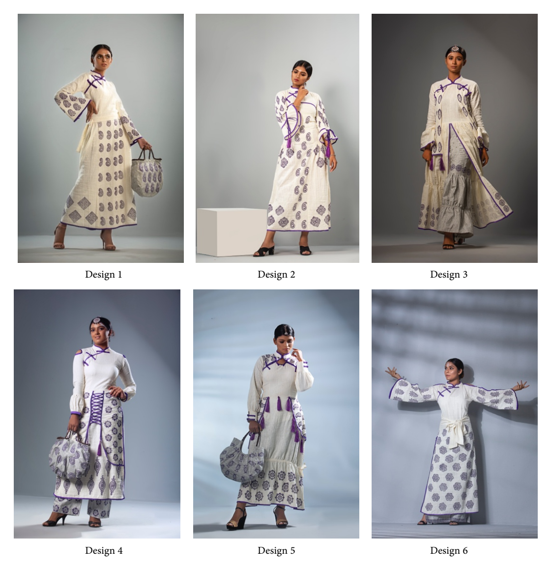
Figure 2. Different designs of developed Qipao.

demand for the developed Qipao's different style, it's different sleeve structure, the fabrics, and the surface ornamentation process. The questionnaire was used in Likert Scale method from "Highly Accepted", "Accepted", "Medium Accepted", "Lower Accepted", "Not Accepted", followed by an assignment 5, 4, 3, 2, 1 points. The data was conducted through an online survey method. In this survey, the participants were chosen as young because they are the ultimate customers for Khadi made Qipao. The online questionnaires were distributed among 100 people and 95 people responded, a total of 91 responses are valid other 4 responses are invalid to collect data. Finally, 91 valid respondent's data were prepared for analysis. Among them 62 were female and the 29 were male. Most of them were the student and their age level is 18 - 28 years. About 68 respondents wanted to buy this Khadi made modern Qipao while the 23 respondents didn't want to buy this Khadi made modern Qipao. Figure 2 and Figure 3 represent different designs of Qipao and its consumer acceptance level.