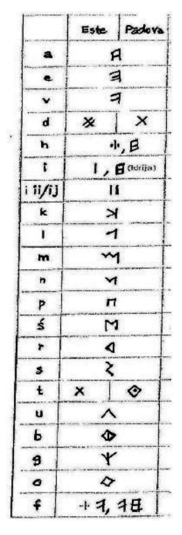
Figure 2. Paleovenetic alphabet.