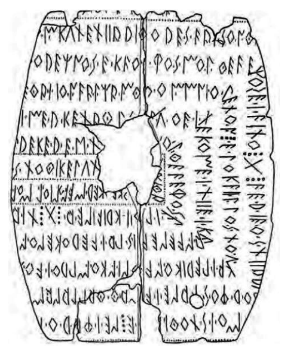
Figure 1. Text engraved in the Tavola da Este (Ambrozič & Tomezzoli, 2003).

This cut-out piece measures 23.5 cm \times 29 cm, has a 0.6 mm thick sheet. Someone thought, at first, it was a greave. But it does not have the form; moreover it is