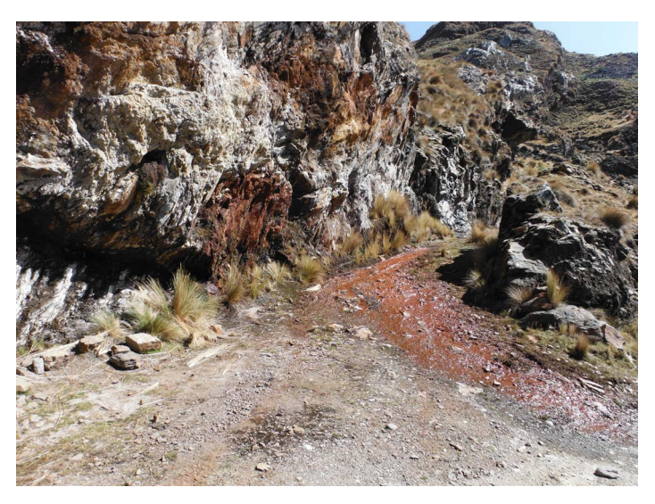
Figure 2. Samples of cinnabar were taken at northeast-trending fault along road that parallels Lago Pelagatos.

<u>Chonta/Huallaca/Queropalca (4) site visit</u>—The Chonta and Queropalca occurrences (Garbín, 1904; Giles, undated) may be accessed by a well-marked dirt road from Huallanca, to La Unión, and Baños. These occurrences were supposedly discovered upon orders from Spain in 1756 to find new sources of mercury to be used for Colonial silver amalgamation. However, it is very likely that these cinnabar-mercury occurrences were first known to pre-Inca people as a source of pigment as well as native mercury—early use of cinnabar as a red pigment by the Ohlone people in California led to the "discovery" of the New Almaden mercury mines in California by Spanish explorers (Lanyon & Bulmore, 1967; Boulland & Boudreault, 2006).