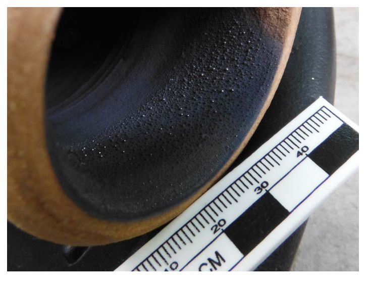
Figure 8. Mercury droplets in black mercury-rich residue along rim of ceramic retort. This black sooty residue in the retorts at New Almaden was scraped and removed to obtain additional mercury (Boulland & Boudreault, 2006).