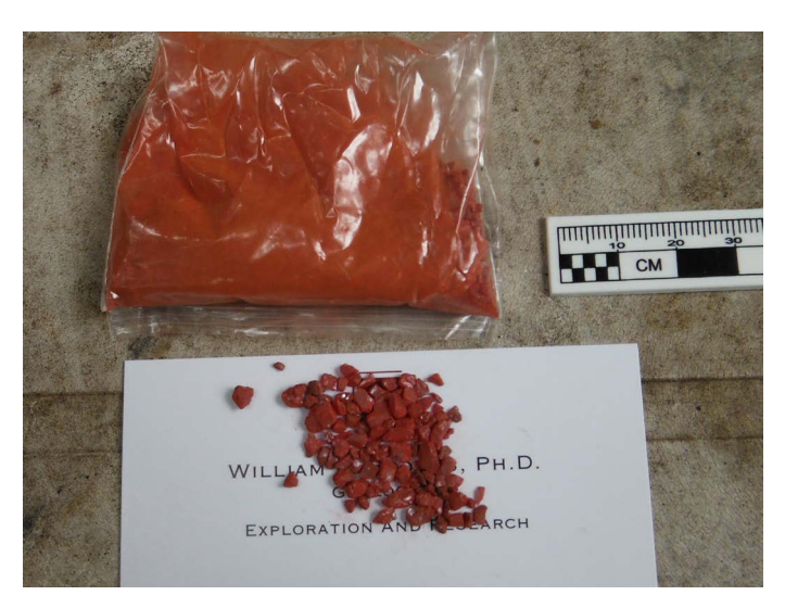
Figure 5. Cinnabar ore (~50 g).