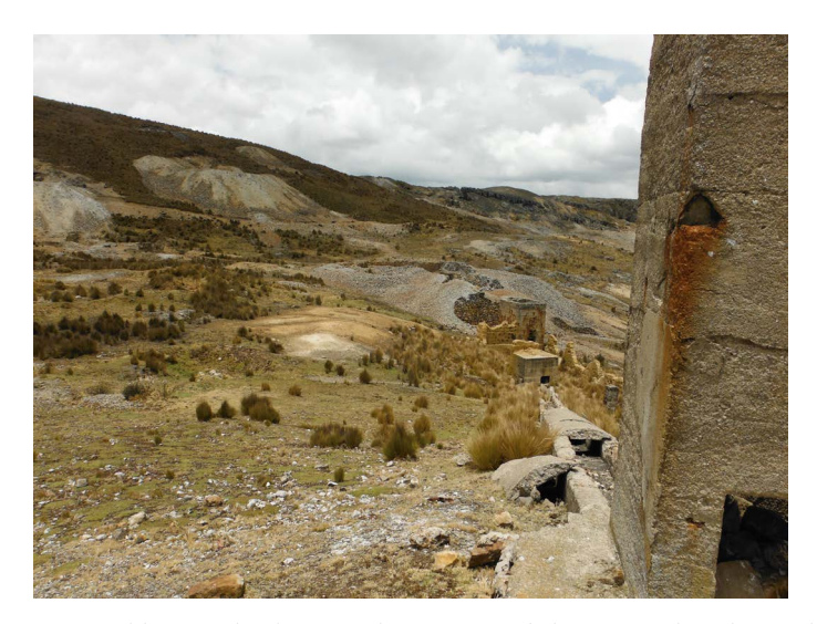
Figure 4. Buildings and tailings at Chonta, ground chimney and stack to right.

Samples from Chonta for this reconnaissance contained > 1000 ppm mercury; 10 - 199 ppm silver; 84 - 6391 ppm arsenic; 21 - 367 ppm antimony, and 31 -9503 ppm zinc. Gold values are 0.01 - 0.07 ppm, but may increase with depth ( Table 1 ). These elements are all above background and indicate further study focused on silver and gold in association with mercury ( Turekian & Wedepohl , 1961; Noble & Vidal, 1990). Specifically, the high arsenic is a pathfinder for gold and the high mercury content is an indicator of lead-zinc-silver ore (Rose et al., 1979).