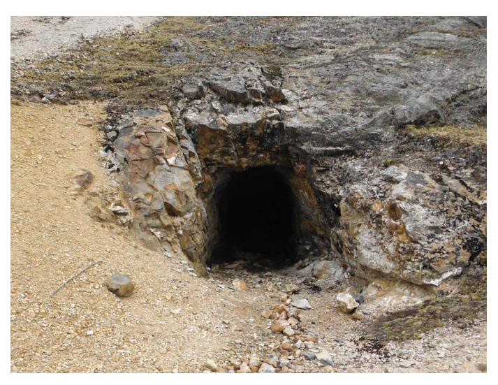
Figure 3. Mine entrance at Chonta, note vertical structure to right of entry.