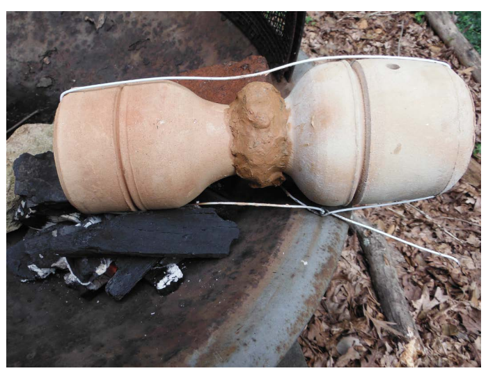
Figure 7. Retort in place with charcoal fuel (~600°F).