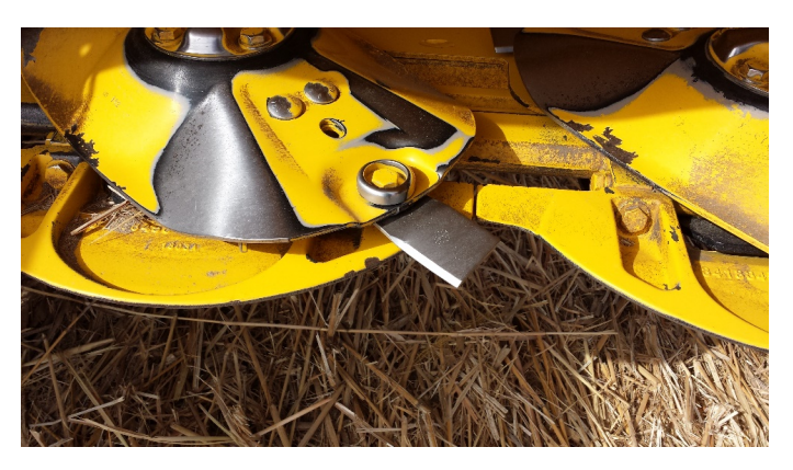
Figure 1. Disc mower blade.

Switchgrass drying rate can be improved through a combination of intensive conditioning and wide swath drying. This method of roll conditioning crushes and scuffs the stems which disturbs the plants' cutin layer and flattens the stem nodes. This provides a better way for water vapor to leave the stem and dry faster. Although, wide swath drying decreases field drying time, it requires an additional field operation to rake wide swaths into windrows that can be picked up with commercially available balers [16].