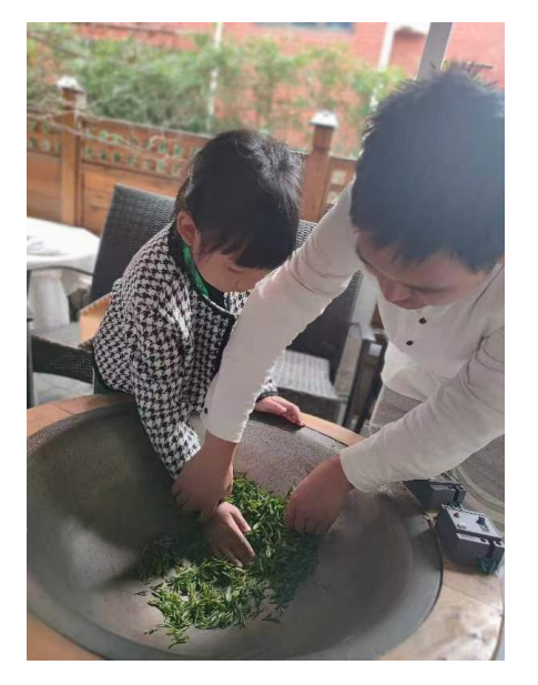
Figure 4. Tea worker teaches pupil how to fry tea.

The social practices and activities of Shaoxing tea culture have unique significance in the expression of identity. Through tea culture festivals, tea performances and other activities (Figure 5), Shaoxing tea culture is not only a way of social interaction, but also a form of identity expression. In the social practice of tea culture, people meet friends with tea, tasting tea and listening to tea performance together, and this common experience deepens people's identity and