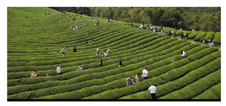
Figure 3. Families participate in tea picking study program.

etc. These activities fully demonstrate a deep concern for and expression of local identity. These initiatives have not only strengthened the Shaoxing people's identification with their own regional culture, but also enhanced the influence and cohesion of Shaoxing tea culture in the local community.