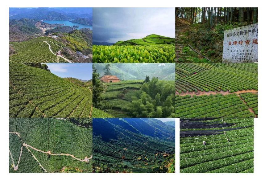
Figure 1. Growing area of Shaoxing tea.

Shaoxing tea is represented by famous varieties such as Longjing tea, Majian tea, Xianhao tea and White tea (Figure 2). Among them, Longjing tea leaves are bright green, straight, fragrant and long-lasting, sweet and refreshing taste, known for its tenderness and freshness; Tieguanyin tea leaves are curved in shape like iron ropes, the tea soup is bright orange and yellow, the aroma is strong and long-lasting, the taste is smooth and mellow, and it has unique rocky rhyme; Bi Luochun tea leaves are thin, straight and even, full of white hairs, the soup color is clear and emerald green, the fragrance is fresh and elevated, the taste is fresh and refreshing, and the taste is fresh and sweet, it is one of the green tea varieties with unique characteristics. These tea varieties are not only unique in flavor, but also in taste. These tea varieties not only taste unique, but also has a rich nutritional content, loved by tea drinkers (Fan et al., 2012).