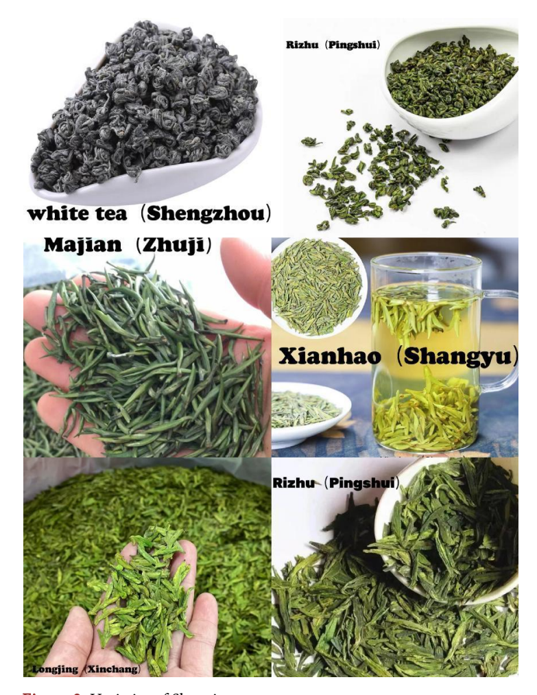
Figure 2. Varieties of Shaoxing tea.