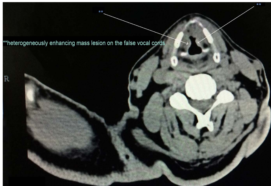
Figure 2. CT scan: heterogeneously enhancing mass lesion on the false vocal cords.