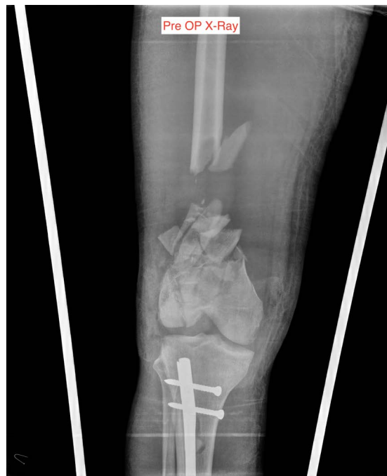
Figure 2. 21-year old male with compound C3 fracture of the right distal femur with 12 cm bone defect with ipsilateral shaft tibia fracture.

For the distal femur fracture the lateral approach was used and the fracture site was exposed. Hematoma was drained and the condylar fragments were reduced and fixed with cancellous screws and kirshner wires. Once the articular reduction was achieved we proceeded to build up the medial column. A Harms cage was taken of the size of the defect, in this case 12 cm and filled up with iliac bone grafts. The cage was inserted through the fracture site and punched all the way medially so that it filled up the medium column defect .Then the lateral column was anatomically reduced with the condyles and distal femur locking plate was applied (Figure 3). Patient was given an above knee cast and was kept nil weight bearing for 8 weeks. Physiotherapy was started at post op day 3. Patient was discharged at day 15 after stitch removal and AK cast reapplication. ROM exercises for the knee began at 6 weeks. Patient was allowed gradual weight bearing at 10 weeks. Patient was asked to follow up monthly and X-rays were taken.