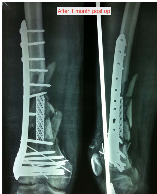
Figure 4. 1 month Post-operative Anteroposterior (AP) and Lateral views showing soft callus formation along the harms cage.

Soft callus formation started appearing at 5 weeks ( Figure 4 ) and by 3months distinct hard callus formation with reconstruction of the medial column was seen in both AP and Lateral views ( Figure 5 ) Good bone union was achieved by