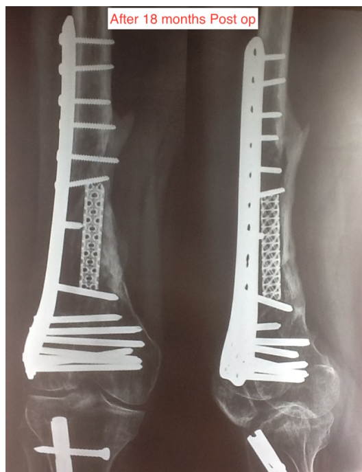
Figure 6. Complete bony union seen at 18 months in both AP and Lateral views with remodeling the fracture site.