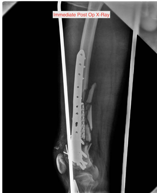
Figure 3. Immediate post-operative x-ray of the lateral view showing anatomically well reduced fracture fixed with the locking plate laterally and Harms cage with bone.