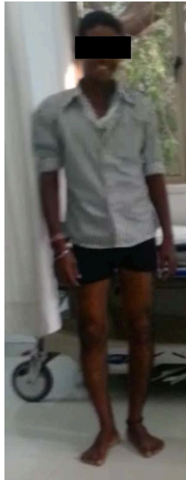
Figure 7. Clinical Photograph of the patient at 18 months standing.