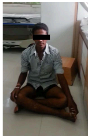
Figure 8. Clinical Photograph of the patient at 18 months cross-legged sitting on the floor.