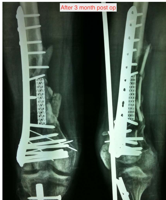
Figure 5. 3 month follow up of the patient showing distinct hard callus formation with reconstruction of the medial column in both AP and lateral views.

6 months. By 18 months complete bony union with bony remodeling was visible on x-rays. (Figure 6) Patient had full extension and knee flexion up to 110 degrees and complete return of all his activities (Figure 7 and Figure 8).