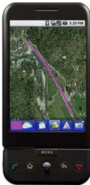
Figure 3. App with real time traffic indication along a user predefined route with data coming from a fleet of cars. Purple color indicates heavy traffic. Icon below refer to other information related to the user defined route (e.g. weather alert, fog alert).

Moreover transfer schemes commonly used in meteorological models, often do not account for small scale variability of the earth surface, because measurements of the atmospheric conditions do not exist in such a high spatial resolution to force the models. A high resolution grid of data coming from the ground improve a lot the performances of the models or validate the models themselves, and ad hoc WSNs can be used for these purposes [17].