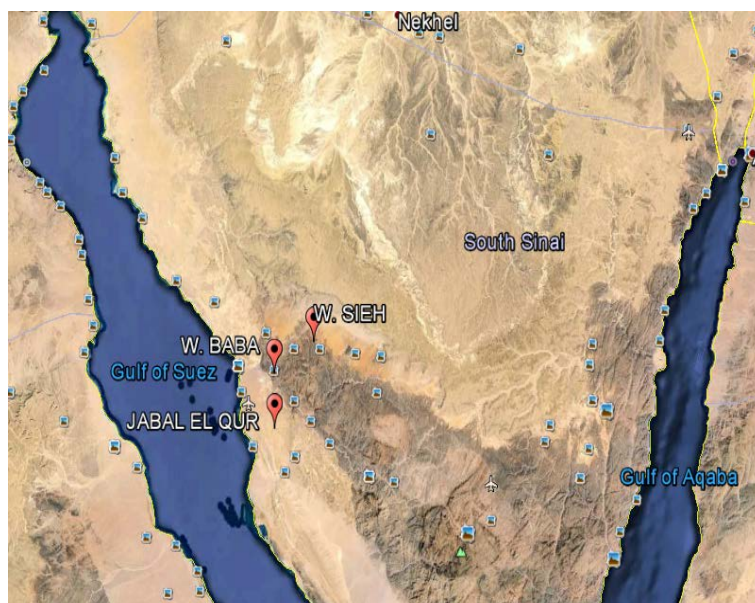
Figure 1. Location map of the collected samples.