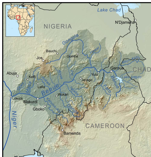
Figure 2. Map of Cameroon showing Garoua town, River Benue, The drainage, Lagdo Dam and Relief.

The case study site, Garoua, is the economic and administrative capital of the North Region, and the most densely populated town in Cameroon (see Figure 2 ) [20]. Garoua is host to several industries and agricultural parastatals that in