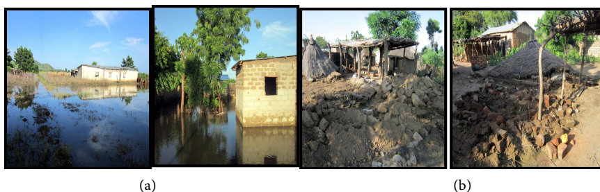
Figure 2. (a) Houses built on flood plains in Garoua; (b) Source: Collapse mud houses following floods in Garoua in 2012.

houses have been built with mud and sticks that easily collapse when flooded (see Figure 2(b) ). Consequently, the houses are easily flooded even with low water-level rises after heavy rains. The inability to live in a safe area, and construct resilient houses, is directly linked to poverty and limited access to resources [8].