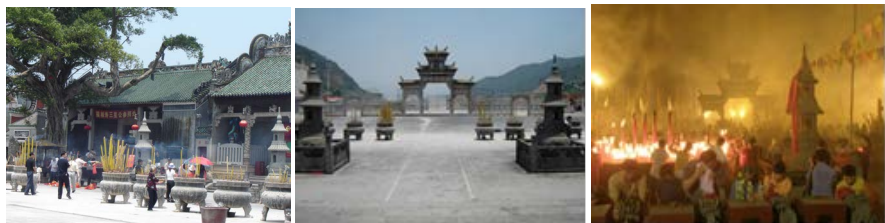
Figure 1. Dragon mother temple.

As an original culture rooted in long history and tradition, the kernel of dragon-mother worship is a nature/totem worship of dragon combined with worship of Great Mother [4], with which producing a lot of vital religious images and symbolic, creating fundamental life meanings for Xijiang River people over thousand years. However, in the rise and wave of exploitation, or “culture-led regeneration”, the cultural development game seems far from being a “win-win” one [5]. Cultural heritage is implicated in the complicated choices made by local and ordinary individuals in the face of political control and capital accumulation [6]. We should alarm that the transformation of authentic culture under the guise of urban/government entrepreneurialism and the ubiquitous logic of