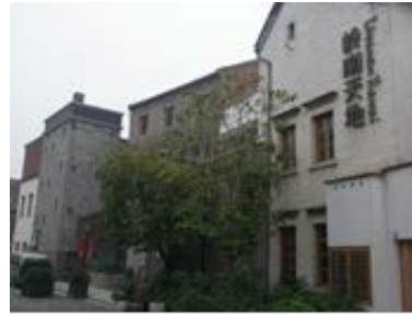
Figure 3. Lingnan Tiandi.