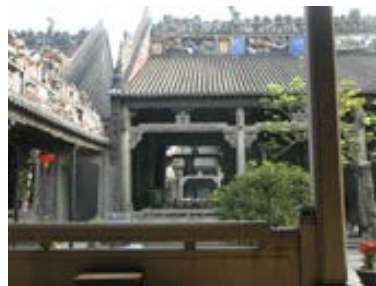
Figure 4. Chen Clan Academy.

much more fundamental level, seeking universal and profound concepts and evaluation standard for heritage that become crucial. Those issues cannot be apart from discussion of a concept “authenticity”.