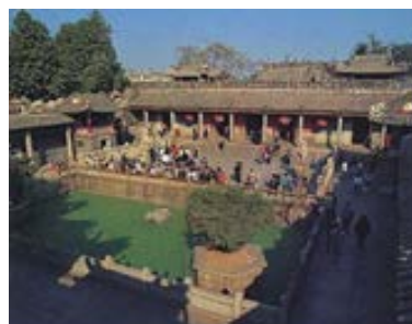
Figure 2. North Lord Temple.

Because of its advantage in aspects of architectural aesthetics, historical memory, cultural taste and place making, in North Lord Temple's historic district, a renewal project Lingnan Tiandi has been developing. This renovation project tries to answer the question how to do with industry transformation, urban transformation and environment reconstruction, and exploring scientific development pattern, which is attracting wide range attention and creating appeal of the city, as shown in Figure 3 . However, couple with the problem of gentrification, the practice of Lingnan Tiandi project also triggers a doubt concerning