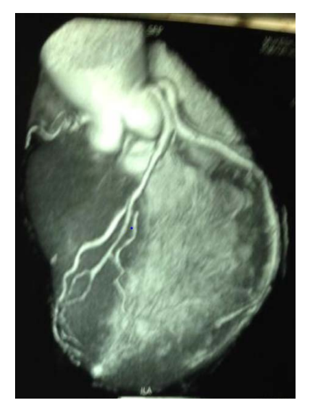
Figure 1. CT coronary angiography image showing separate origin of LAD and LCX.

Patient was discharged with Tab Warfarin and Tab Aspirin for anticoagulation.