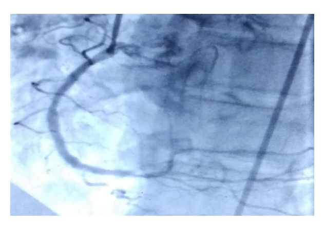
Figure 3. Coronary angiography image showing origin of right coronary artery and left main coronary artery from right sinus.