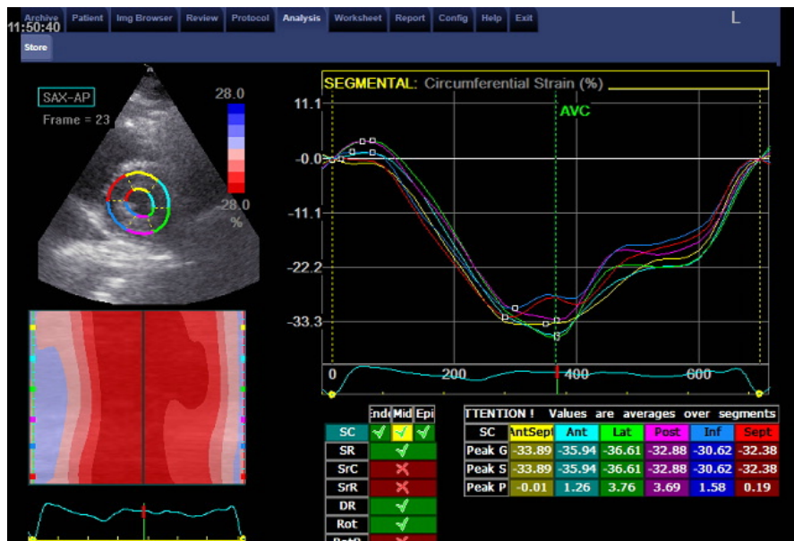
Figure 2. Normal circumferential strain of one of control group.