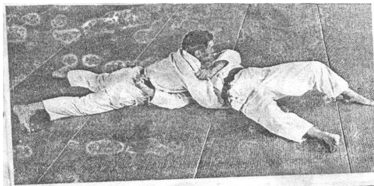
Figure 2. Kami-shiho-gatame .