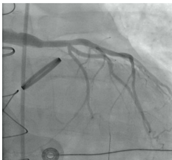
Figure 3. Post-treatment RAO angiogram view after stenting of left limb of Cabrol graft with TIMI 3 flow.