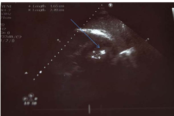
Figure 3. The echocardiographic image of the pellet in the myocardial tissue was marked by arrow.

since these cases are quite rare. Most of these patients are hemodynamically instable, and thus there is not enough time for further diagnostic tests. Although he had cardiac injury, our patient was only diagnosed through further diagnostic tests following colon surgery. Indeed, the cardiovascular consultation was delayed as well. The period between the time of shooting and the cardiovascular consultation was about 8 hours, which we consider to be too long. Therefore, particularly in penetrating shotgun thoracic injuries, the cardiac injury should initially be managed. Also, we consider that well-trained surgeons at the emergency departments can reduce the risk of mortality in such cases. Remarkably, there are some studies reporting that the tamponade that results from penetrating cardiac injuries has a positive effect on mortality [2]. Our patient was present with tamponade as well, but he did not develop mortality. Although he had a cardiac injury, the patient was hemodynamically stable throughout the 8 hours, which we attribute to the fact that 3 pellets had stayed at the myocardium and did not penetrate into heart chambers.