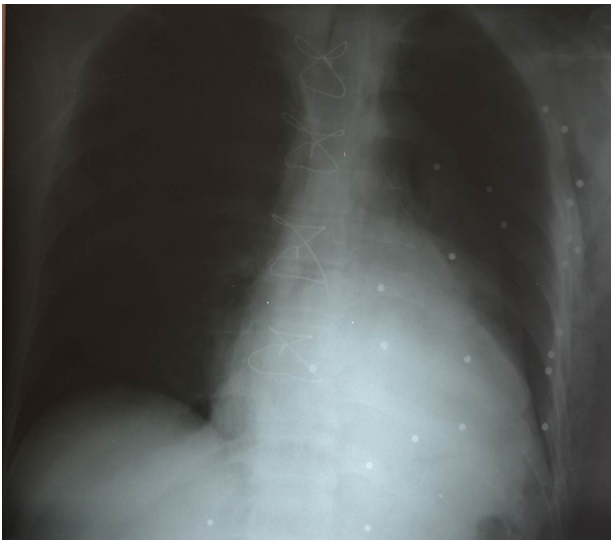
Figure 1. The postoperative PA chest roentgenography (three pellet on the left ventricle posterior wall were marked by arrows).