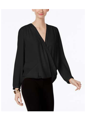
Figure A7. Black long-sleeve blouse.