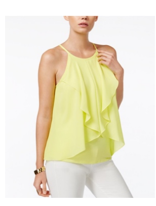
Figure B8. Yellow tank top.