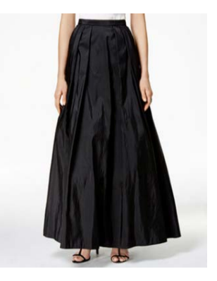
Figure A6. Long black winkle dress.