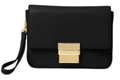
Figure B4. Black leather handbag.