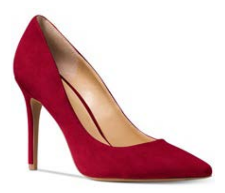
Figure B1. Red heels.

Sexy and revealing fashion products used in the main study.