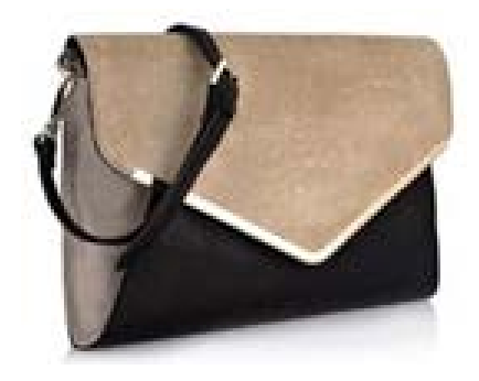
Figure B3. Brown/black handbag.