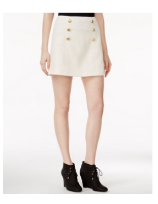
Figure B5. White miniskirt.