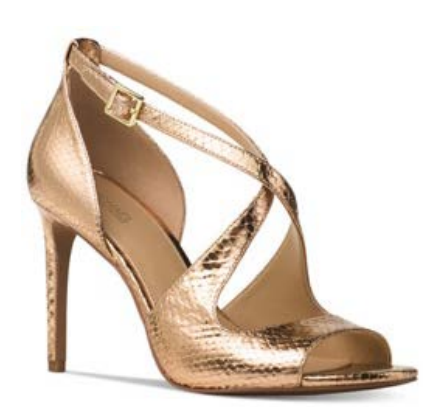
Figure B2. Golden heels.