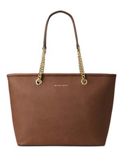
Figure A4. Brown/black evening clutch.