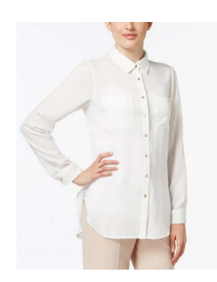
Figure A8. White plain long-sleeve.