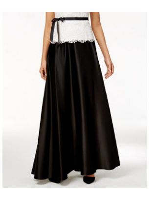
Figure A5. Long black silk dress.