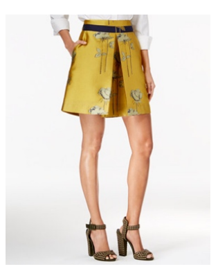
Figure B6. Yellow short dress.