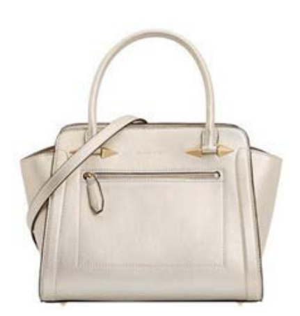
Figure A3. White handbag.