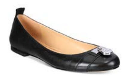
Figure A2. Black flat shoes.