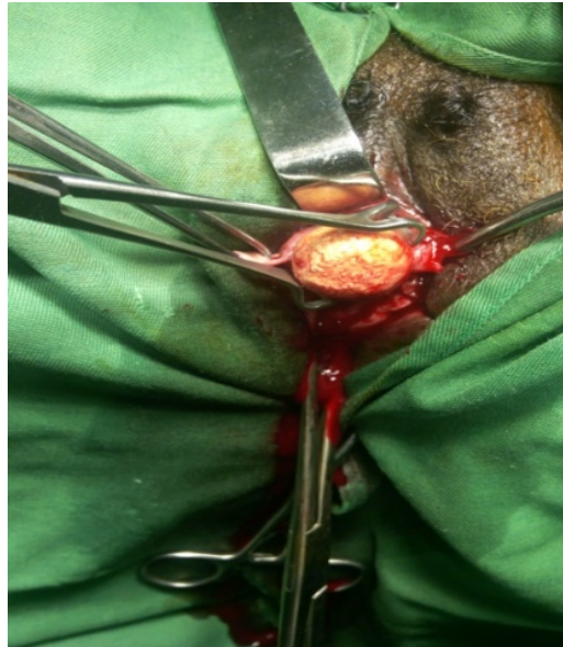
Figure 3. Ablation of the calculus.