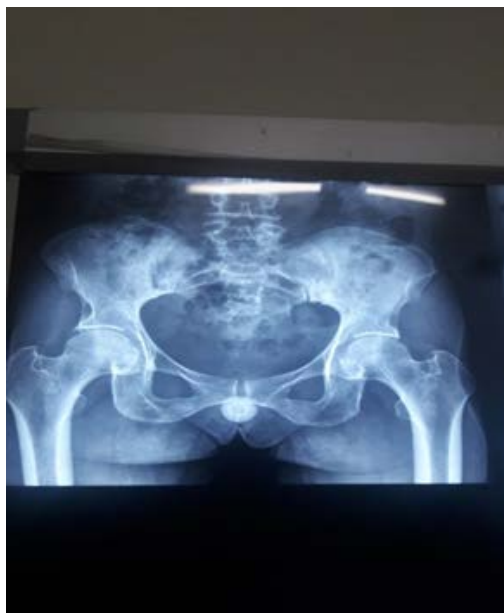
Figure 2. Radio-opaque calculus in the middle third of the urethra.

The cyto-bacteriological examination of the urine did not identify any germs and the urine culture was sterile after unspecified medical treatment. The patient underwent transvaginal diverticulectomy, which consisted of an incision of the inverted U vaginal mucosa, transverse incision and dissection of the peri-urethral fascia, exposure and opening of the gallery ablation of the calculus ( Figure 3 ), excision of the walls, collar and ablation of the niche. We performed overedge closure in three layers with absorbable wire. The urethra was closed longitudinally on probe Ch18, the fascia peri-urethral transverse and the vaginal mucosa at 3/0. The post-surgery evolution was simple and the probe was removed two weeks after the surgery. The anatomopathologic examination of the resected diverticulum showed an aspect compatible with a urethritis gallstone in the urethra.