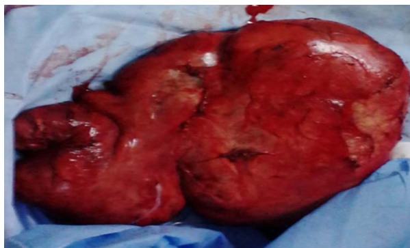
Figure 2. Operative specimen of retroperitoneal mass.