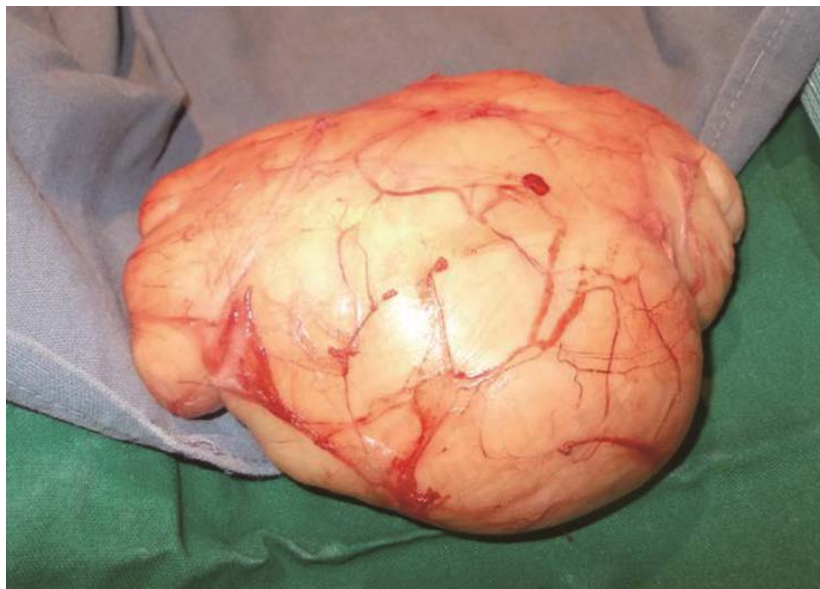
Figure 5. Showing the excised tumor specimen.

while others fails to display the same is still unclear [18]. However, the amount of cortical hyperostosis can vary from a small area of the thickened cortical to exuberant exostoses [13] [14].