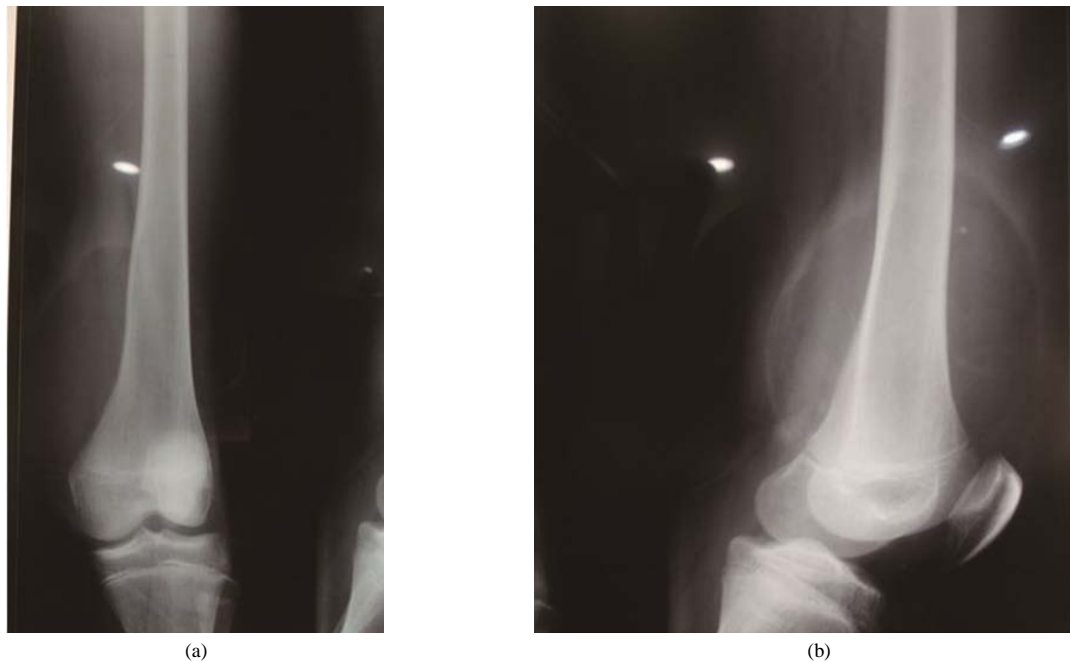
Figure 1. (a) and (b) showing increased periosteal reaction associated with an increase of adjacent radiolucent soft parts.

Computed tomography of the left thigh showed a heterogeneous calcification image in the periosteal topography located in the medial region of the distal third of the femur in the meta-diaphyseal junction. There was no evidence of cortical discontinuity or bone marrow invasion. The lipoma was seen displacing the fat planes, and abutting the synovium of the knee joint. The patello femoral joint, as a result, showed widening. In the muscular plane, the density was similar to that of subcutaneous tissue in the intermediate vastus muscle topography, suggesting fat replacement ( Figure 2, Figure 3 ).