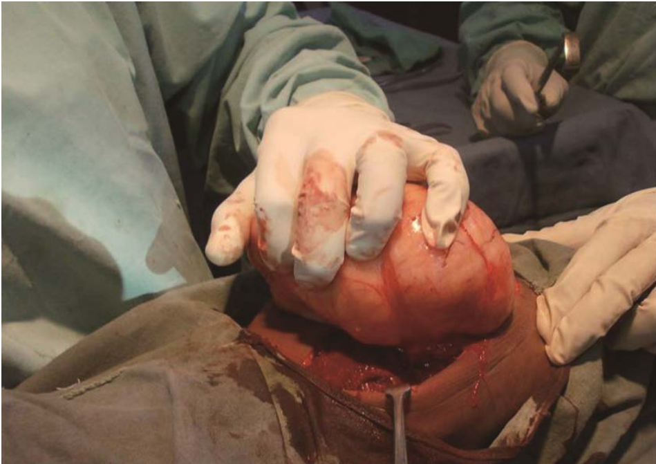
Figure 4. Showing the intraoperative photograph of the lesion adhering to the lower end of the femur.