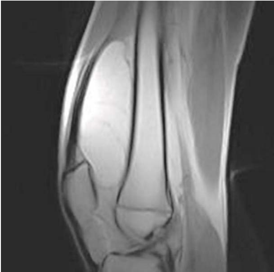
Figure 3. MRI Images showing the tumoral mass and the dilineation.