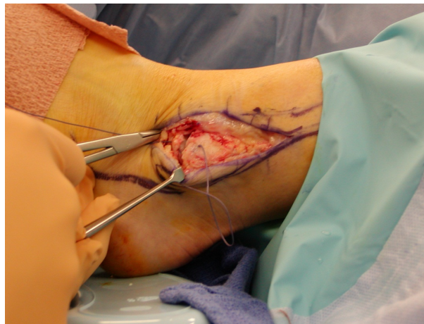
Figure 4. After retinacular ATF and CF ligament repair.

and #2-0 vicryl and 4-0 nylon for skin closure. The triad group followed the same postoperative course as the Broström-Gould and scope group. A modified cast splint was applied for 2 weeks following transition to full weight bearing and return to full activity and sports at 8 - 12 weeks with an ankle stirrup brace.