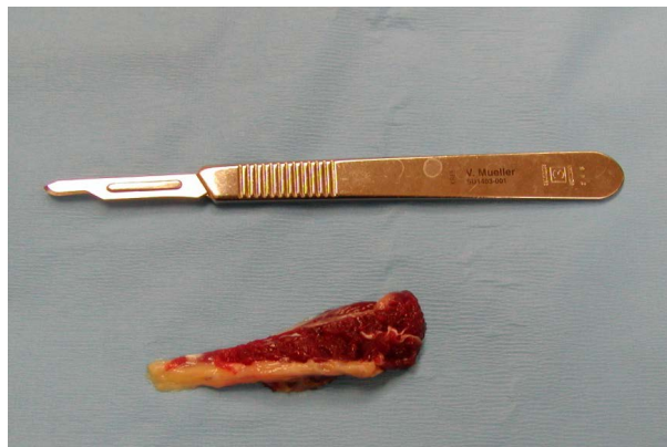
Figure 3. Excision of low lying muscle belly of peroneus brevis.