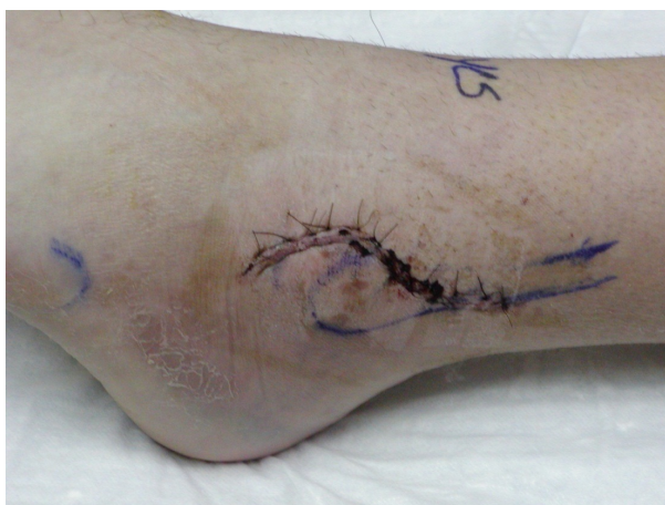
Figure 5. 2 week postop follow-up.