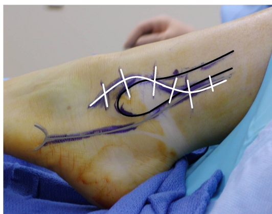
Figure 1. Incision placement triad procedure: White: planned incision; Black: fibula; Grey: peroneal tendons with 5th Metbase.

The triad group consisted of a medial and lateral standard arthroscopy with portal exchange. Any intraarticular pathology was addressed similar to the Broström-Gould group. Following the ankle scope, a modified curvilinear incision was made directly over the lateral ankle gutter ( Figures 1-6 ). Dissection was carried through the subcutaneous tissue exposing and incising the peroneal retinaculum. If present, low lying peroneal muscle belly was debrided to approximately 5 cm proximal to the distal tip of the fibula. If synovitic or mucinous changes were present in the peroneal tendons, an open synovectomy was performed. The peroneal retinaculum was repaired in vest-over-pants type fashion along with the standard Broström-Gould modification utilizing #0, #1,